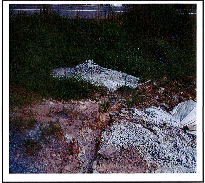
Concrete washout at capacity. Trucks washing next to it.