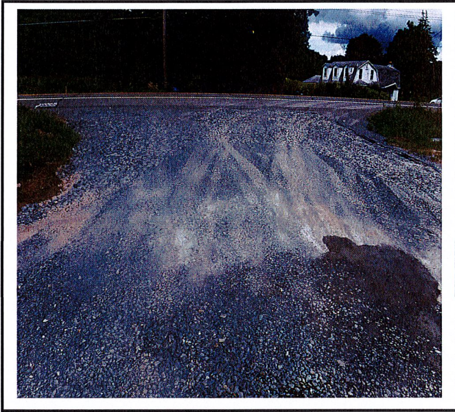
Construction entrance onto Pennsylvania Ave functioning.