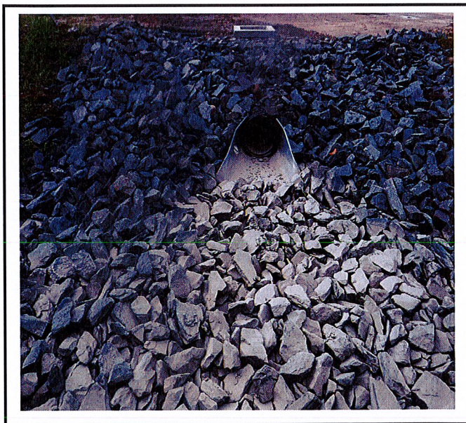
Evidence of sediment leaving pond untreated.