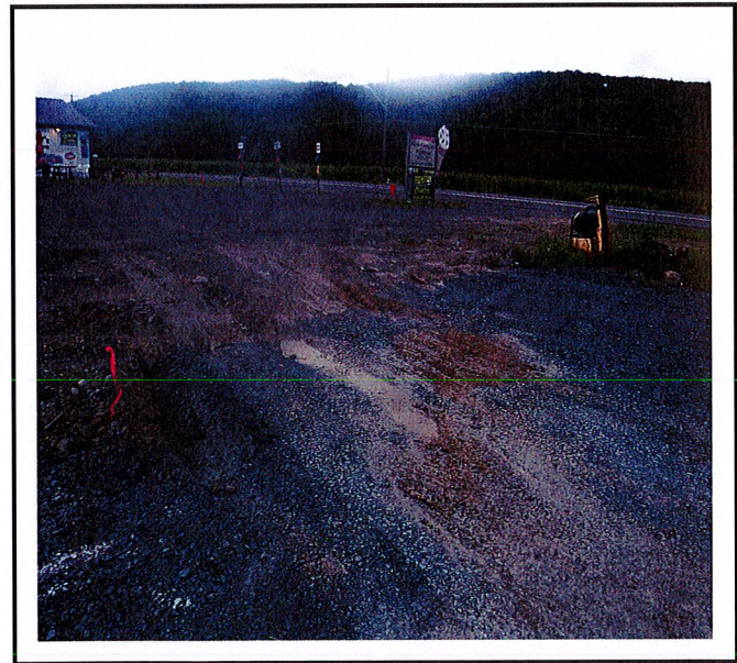
Construction traffic entering and exiting through area without a stabilized entrance.