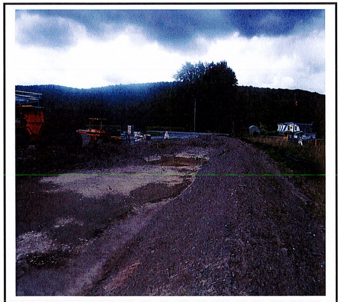
View of stormwater basin from the outlet side of basin.