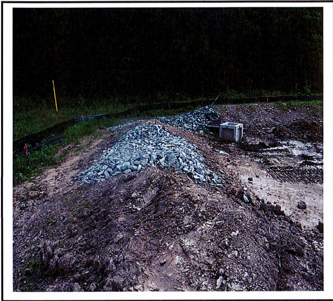
Rock outlet for sediment trap has been installed. It is higher elev. than the actual basin outlet structure so sediment water is exiting through outlet.