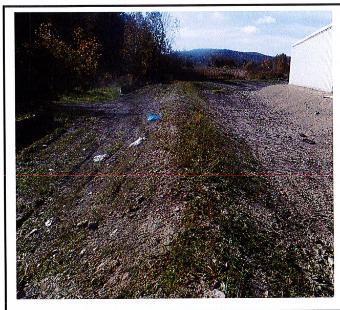
Trash and debris is blowing all around the site.