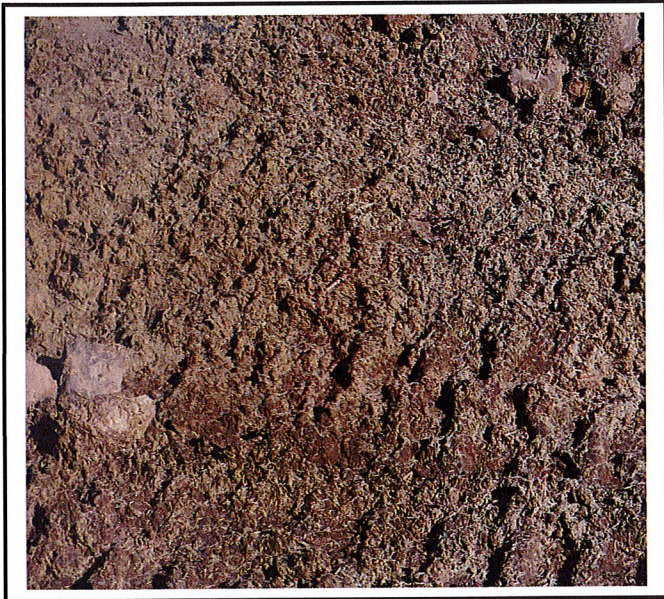
Hydroseeding that was sprayed does not provide the soil coverage required. The soil is to be protected. In this photo you see more soil than mulch.