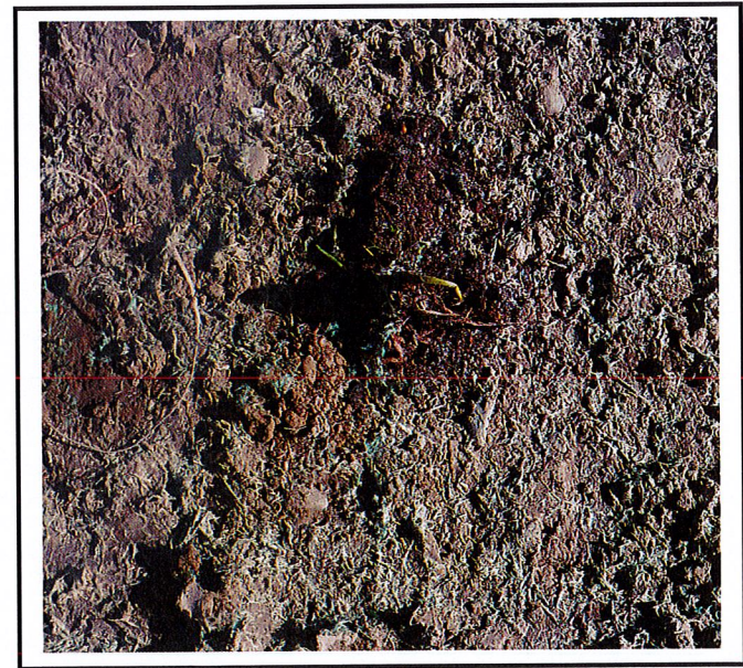
Wetland planting lying on top of ground and not planted. Also note hydroseeding mulch sparse.