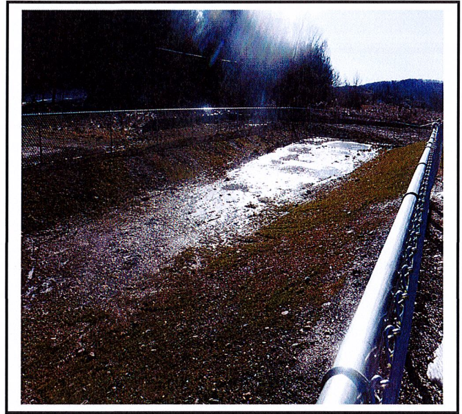
Area where wetland plants are supposed to be planted.