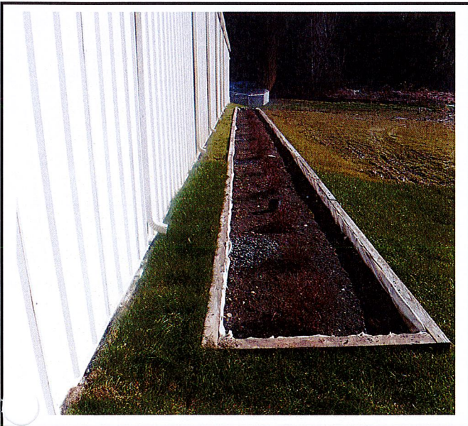
Roof leaders are still not connected to the tree planter box. Erosion is occurring on the end closest to the stormwater basin.