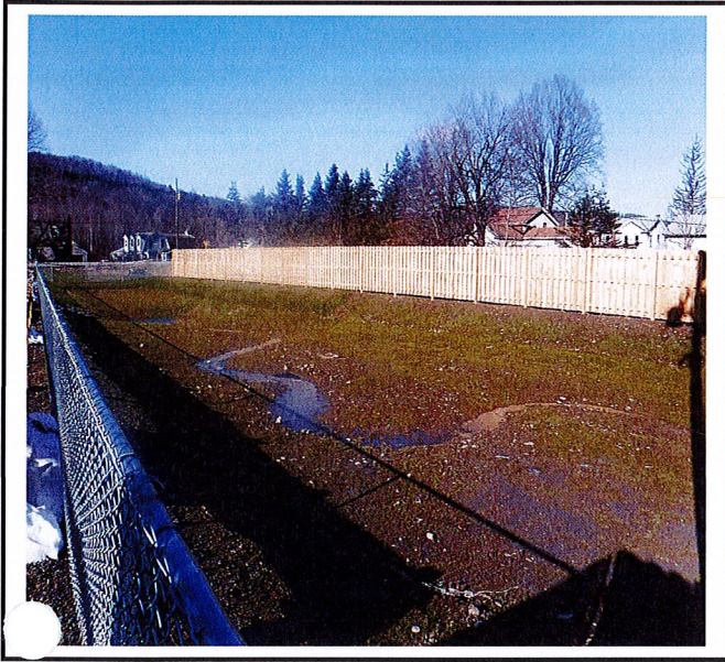
Trash and debris in the pond.