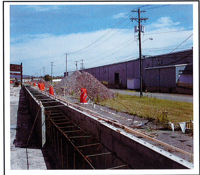
Silt sock is supposed to be along the entire east side of building. None is in place.