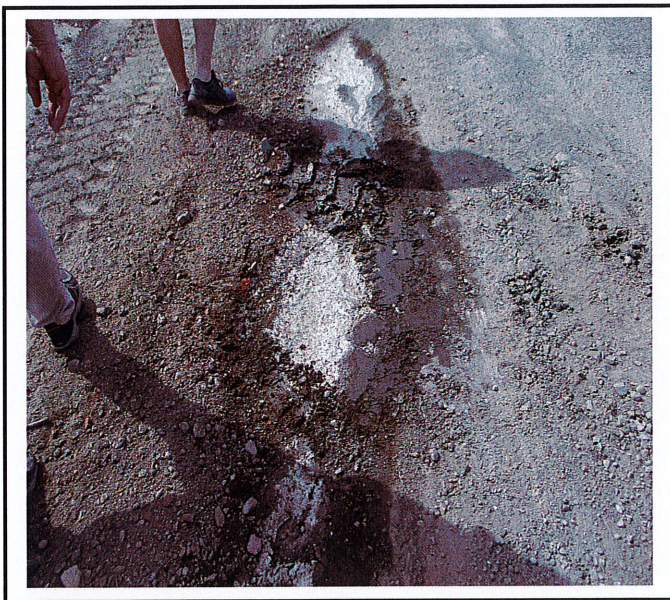
Concrete washout not being used.