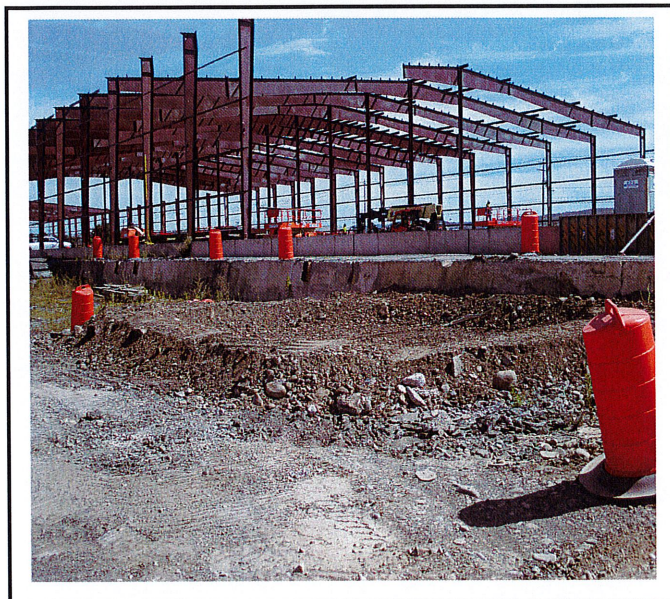
Concrete washout doesn't have liner. The other one has a liner but it isn't held in place correctly.