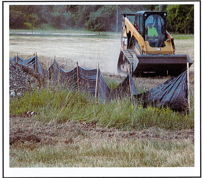
Silt fence installed incorrectly.