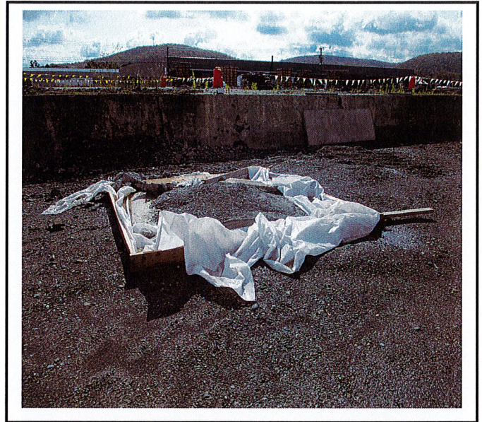
Concrete washout requires maintenance or replacement.