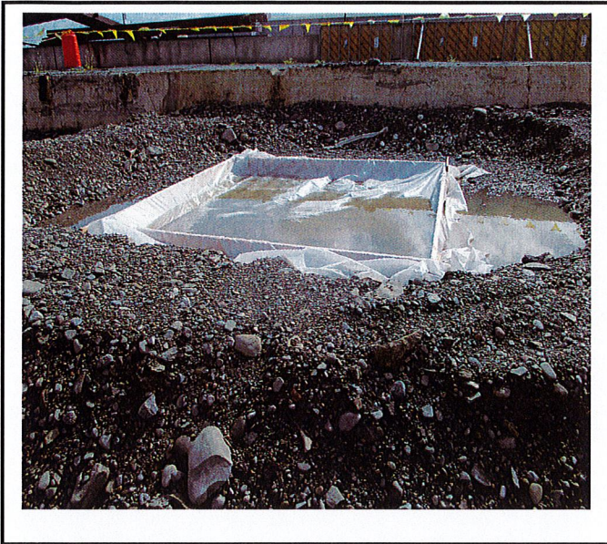
Concrete washout requires maintenance or replacement.