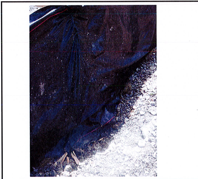
Silt fence needs to be toed in 6 inches.