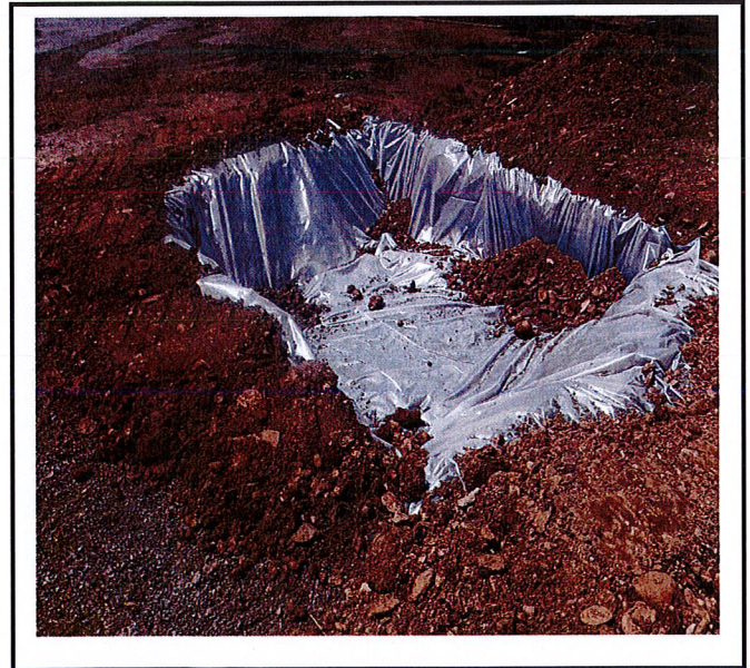
Concrete washout installed.