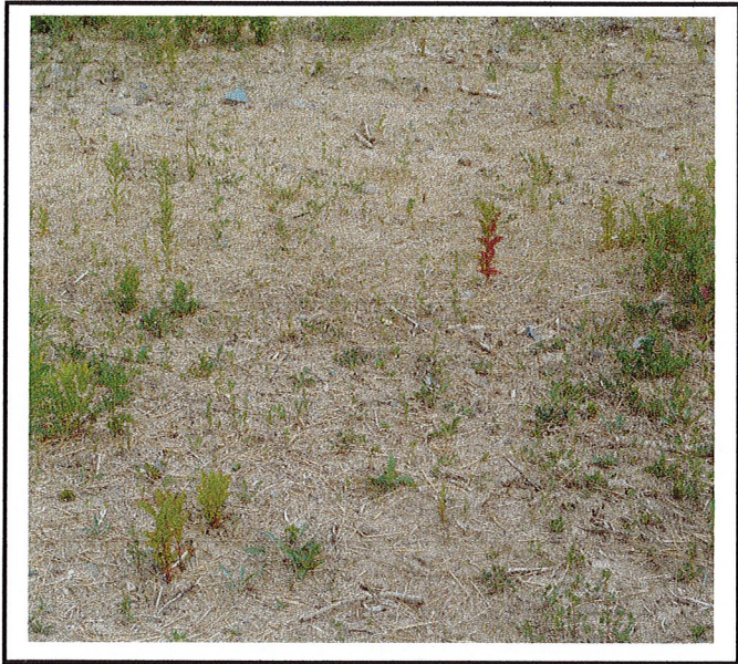
Some areas temporarily stabilized meet the 2 tons per acre and some do not.