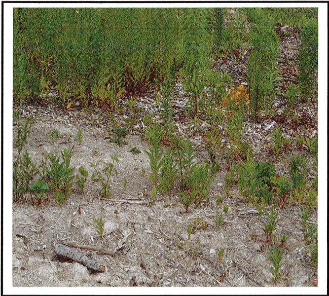
No temporary stabilization applied to this area.