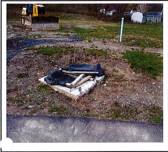
Catch basin protections need to be installed and functioning on all catch basins that are in exposed soil or active construction area.