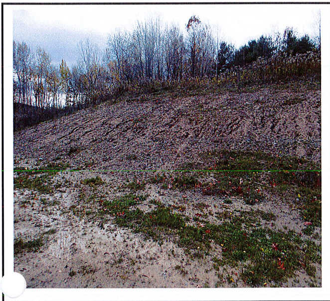
Steep slope needs to be repaired and seeded with a RECP blanket.