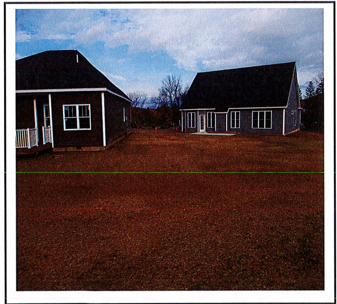
Areas around the house has been stabilized with seed and mulch.