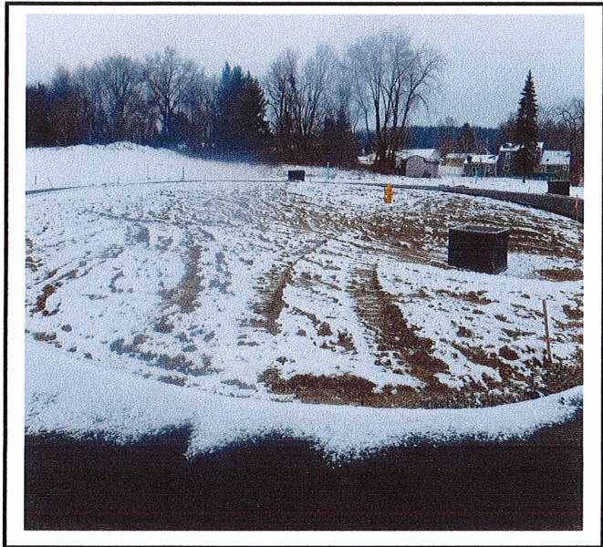
Center island has not been stabilized.