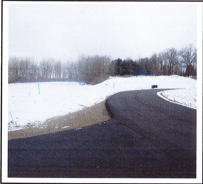
Pavement has been completed since the last municipal inspection.