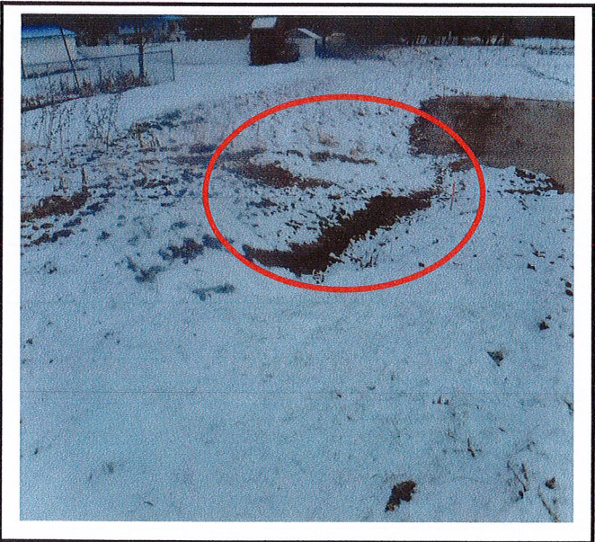
Channel erosion is occurring into the stormwater forebay.- no correction has been made.