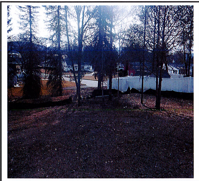
Silt fence around entire property requires repair and replacement.