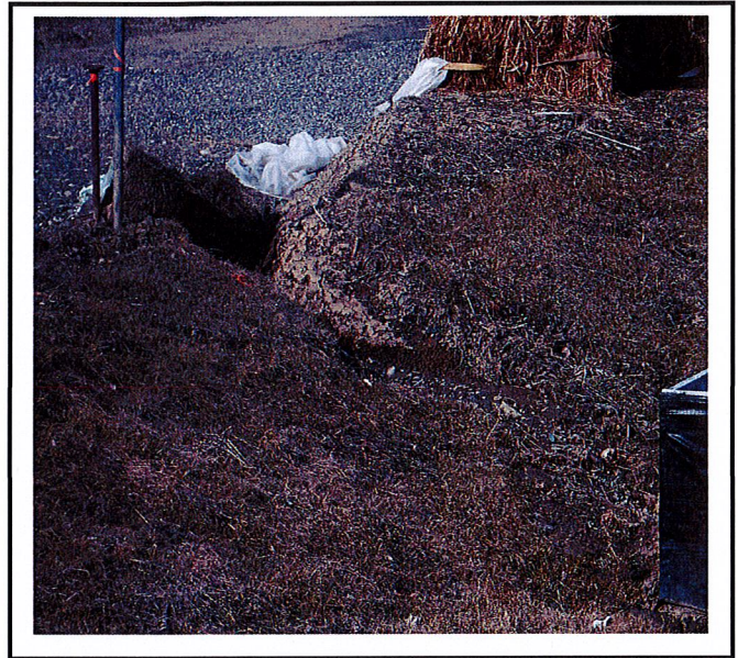
Close up of erosion next to CB 3.