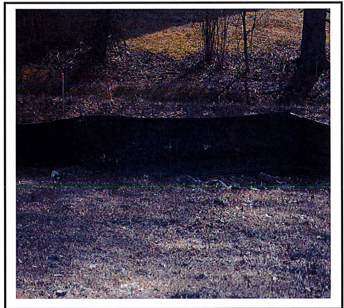
Silt fence with holes from age. Many areas will need to be replaced.