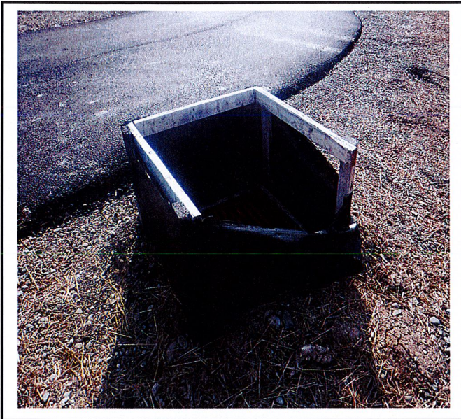
CB 7 drop inlet protection requires repair.