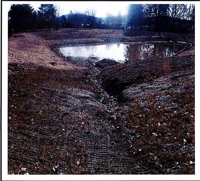
Major erosion from ditch into stormwater basin.