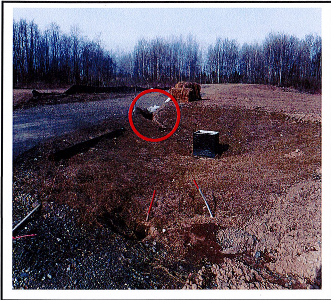
CB 3- erosion occurring off side slope. Straw bale is causing more erosion issues.