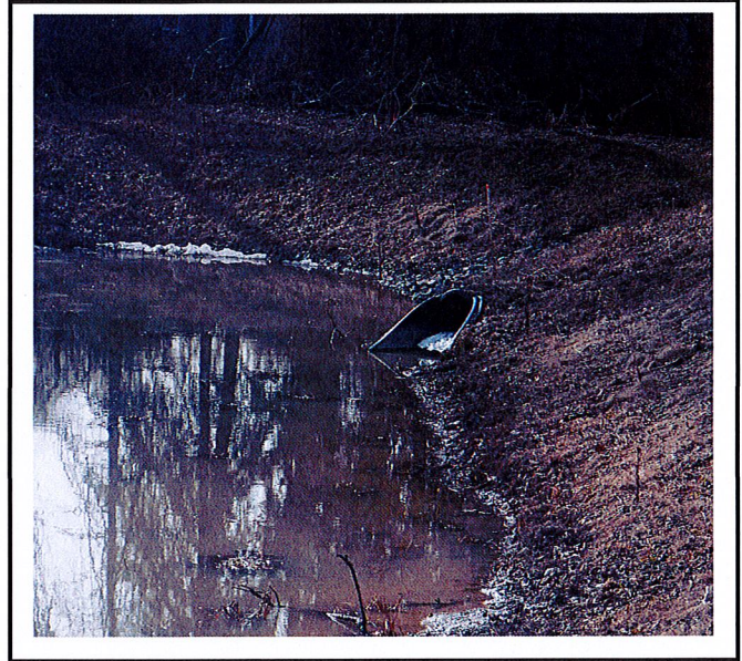
Rock outlet protection has not been installed.