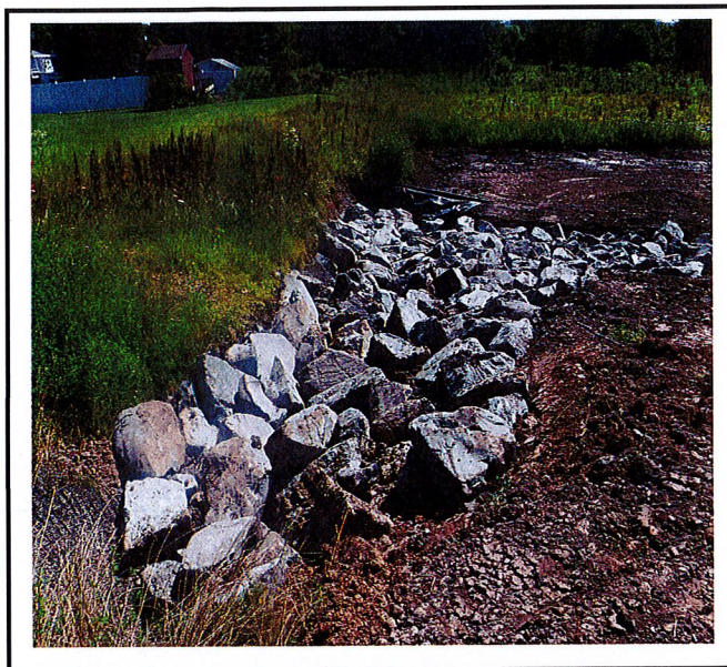
The drainage swale that was eroding has been repaired with medium rip rap in the area that was head cutting.