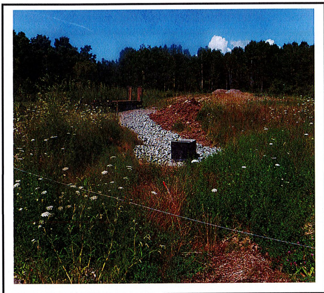
CB 3- The erosion around this catch basin has been repaired with gabion stone