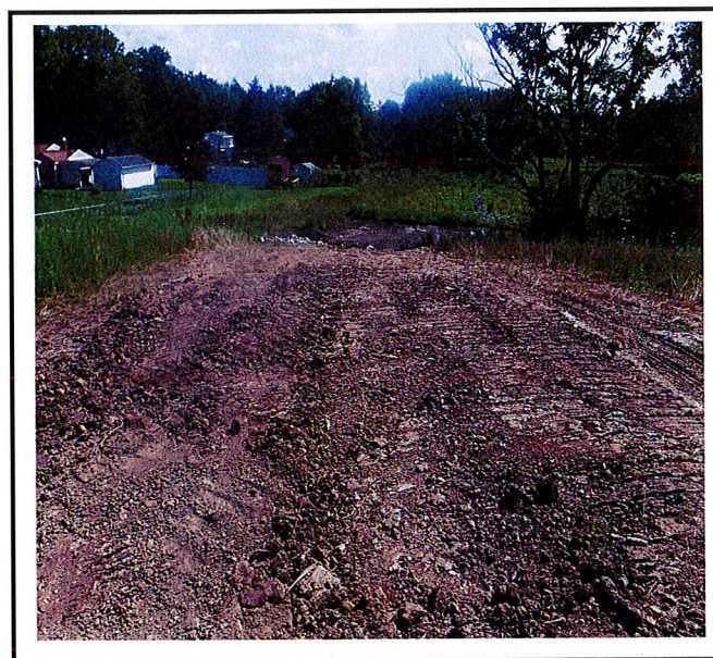
Areas disturbed to clean stormwater forebay out and to install medium riprap protection.