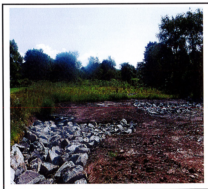
Rock outlet protection has been installed at the inlets into the stormwater basin.