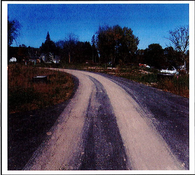
Mud tracked onto road.