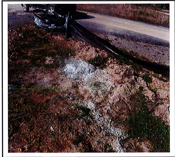
Concrete washed onto the ground in multiple places. Silt fence requires repair.