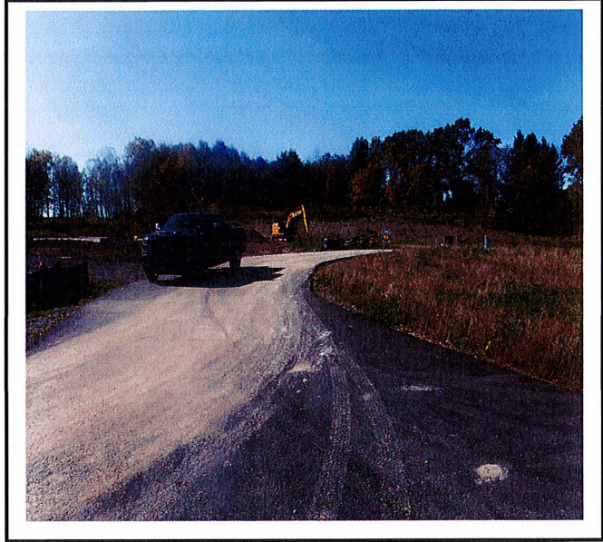
Mud from project around the entire cul de sac road.