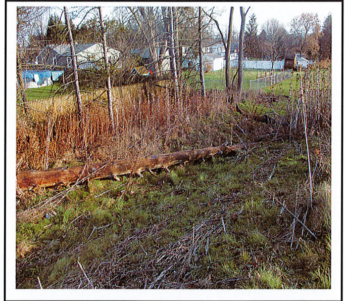
Tree across drainage swale needs to be removed.