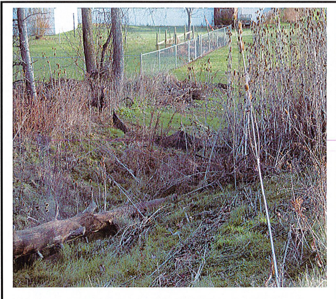
Silt fence across drainage swale needs to be removed.