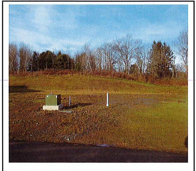
Lot 6 & 7 have been driven over and soil compacted. This are will need to eventually be decompacted.