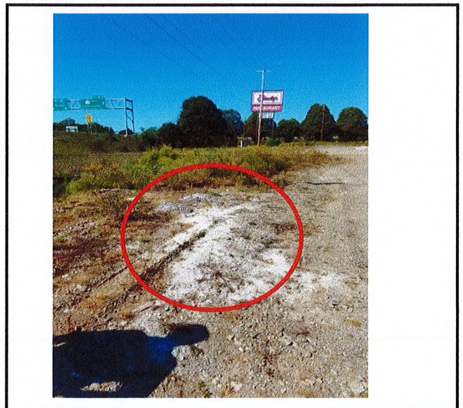
Concrete washed onto the ground.