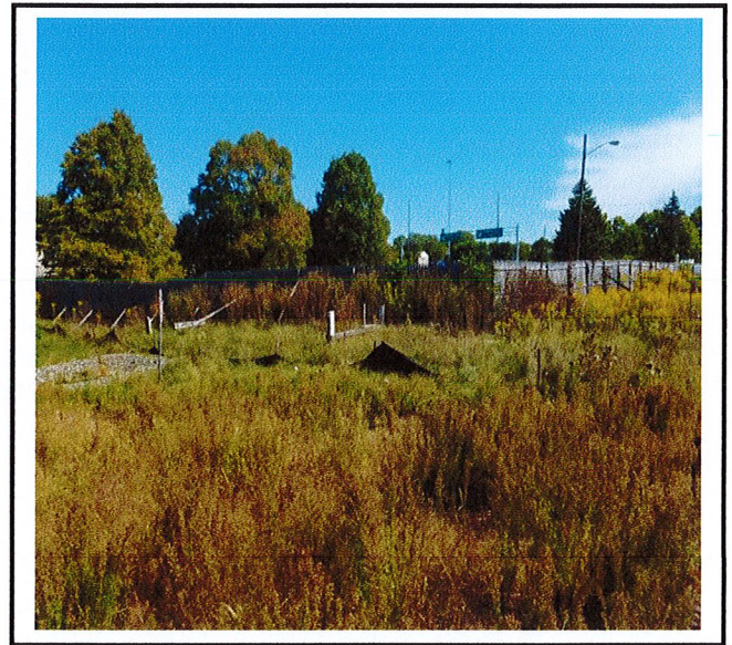
Silt fence requires replacement and repair.