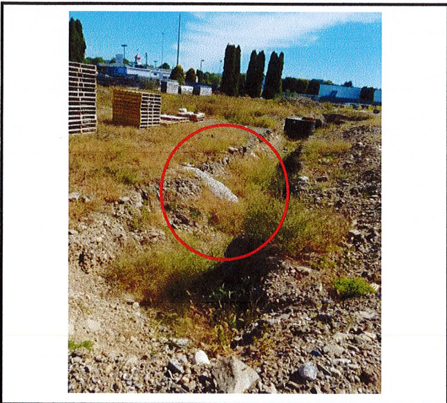
Concrete washed onto the ground.