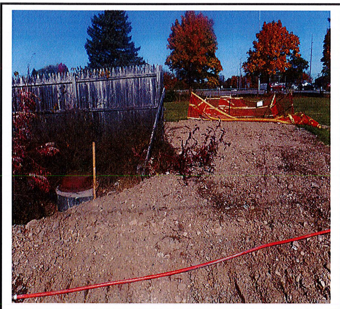
Monitor this area, if sediment becomes an issue leaving the site then install silt fence. Otherwise seed and mulch the area so that it is stabilized.