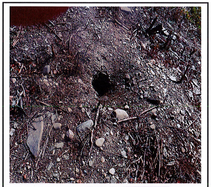
Animal burrows around stormwater basin should be addressed before project is completed.