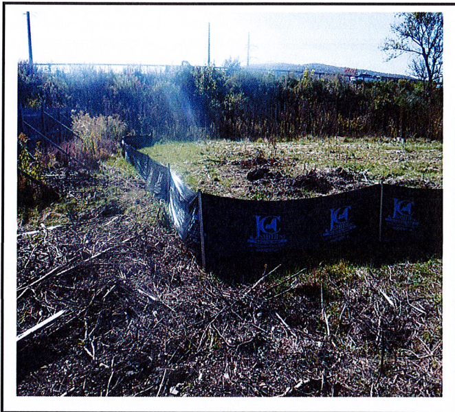
Silt fence is installed backwards.