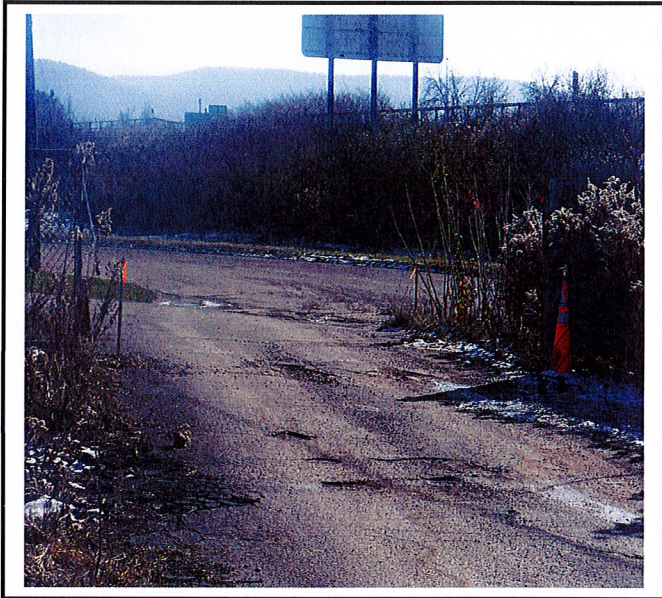
Construction entrance needed at first location off pavement. Too much sediment is getting tracked off site.