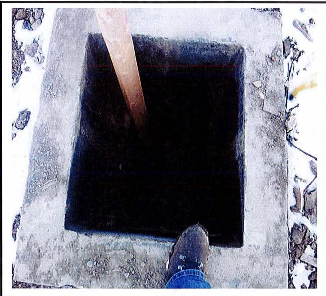
Catch basin grate is required for safety but inlet protection is required to prevent sediment and debris from getting into stormwater basin.