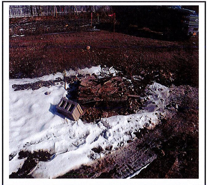
Drop inlet protection required.