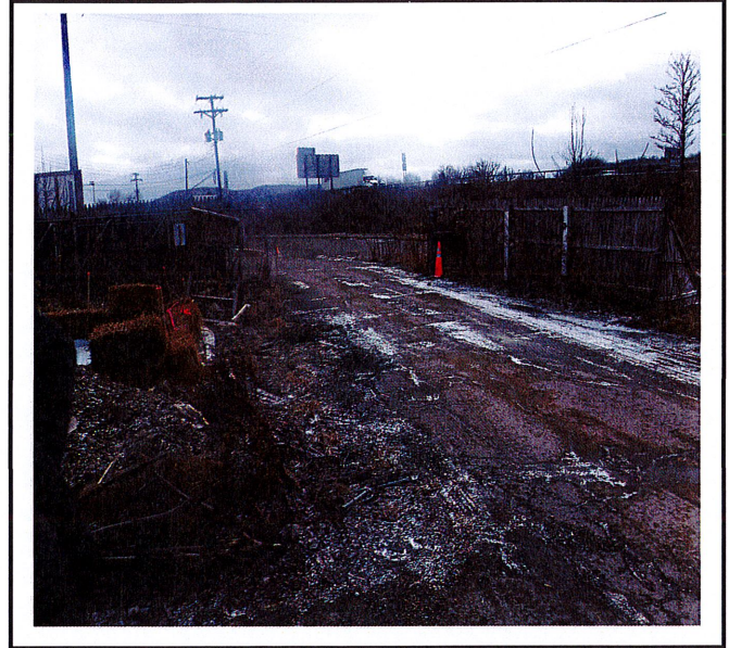
Construction entrance is installed but with warm weather more tracking will occur from employee parking. Monitor and make corrections as needed.