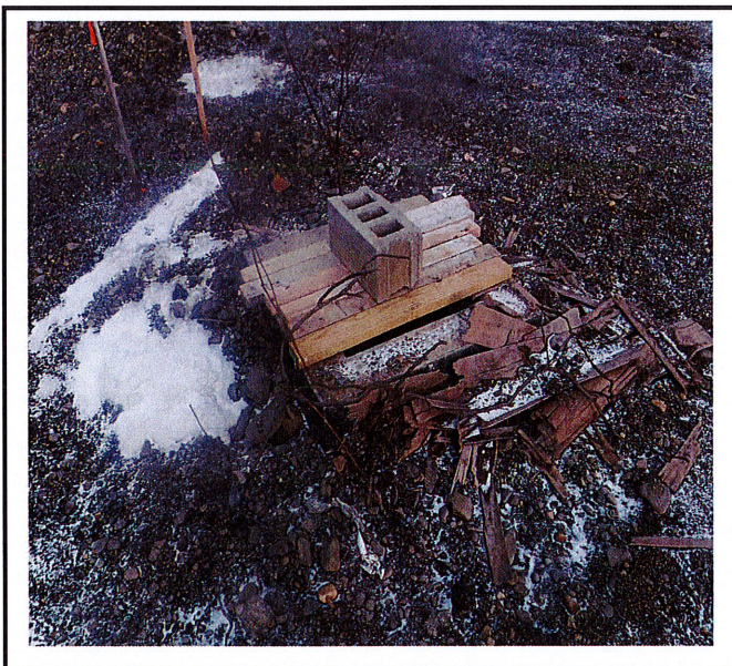
Catch basin inlet protection needed.