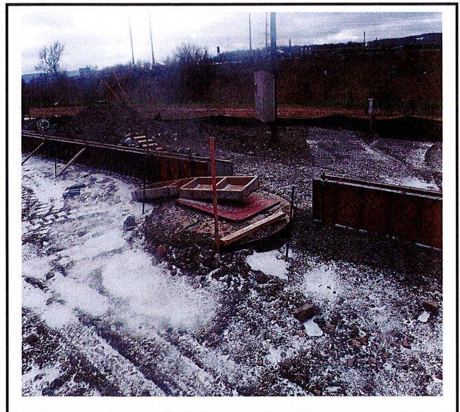
Catch basin protection needed especially from the concrete curb that will be poured next to it.