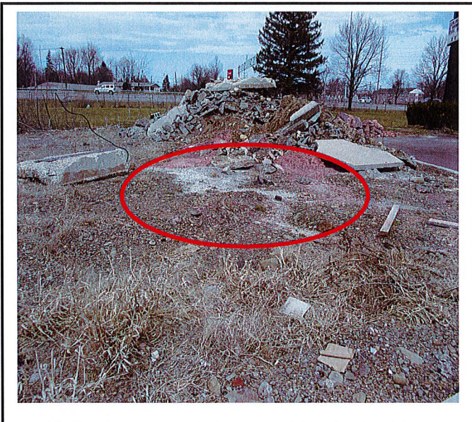
Concrete being washed onto the ground.