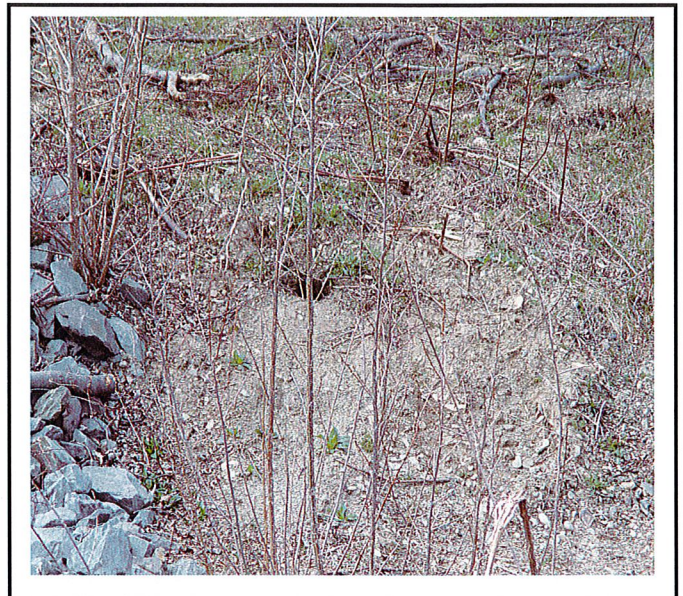
Animal burrows along stormwater basin embankment will need to be addressed prior to final close out.