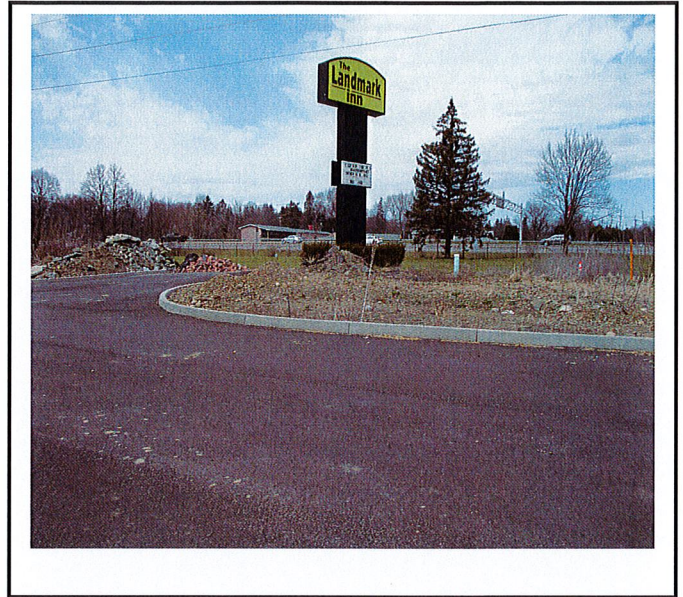
Still many areas of bare soil that require stabilization.