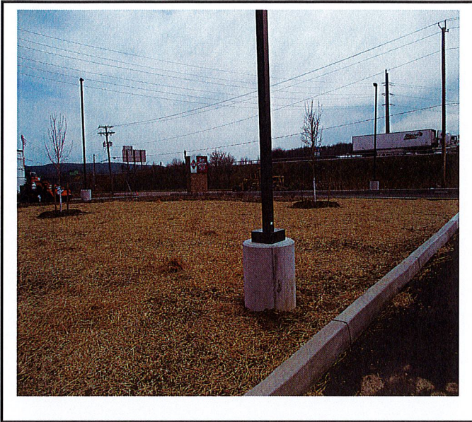
Soils stabilized in some areas of the project.