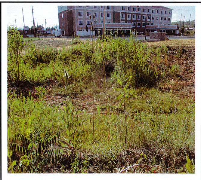
Woody vegetation needs to be removed from the forebay.