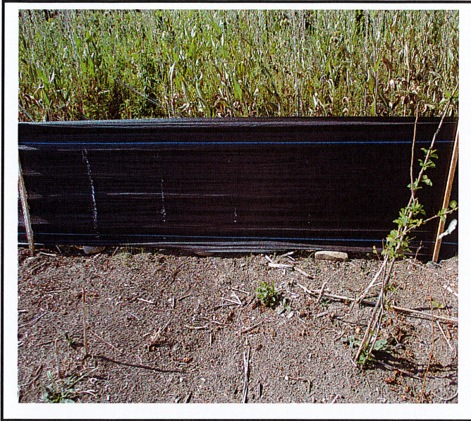
Silt fence is not installed correctly.