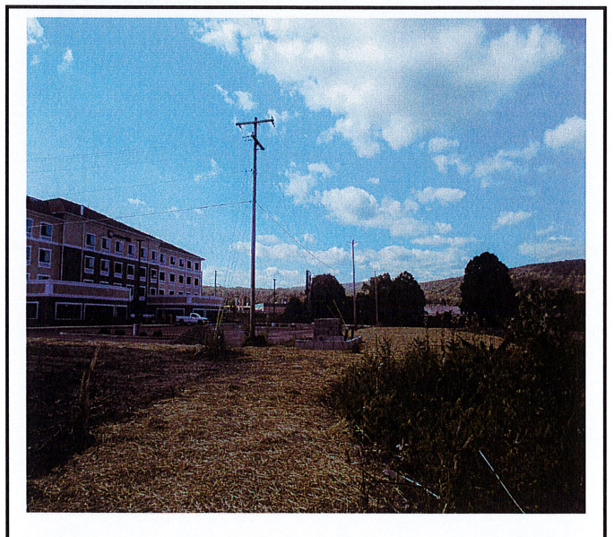
Some areas have been stabilized with straw mulch.