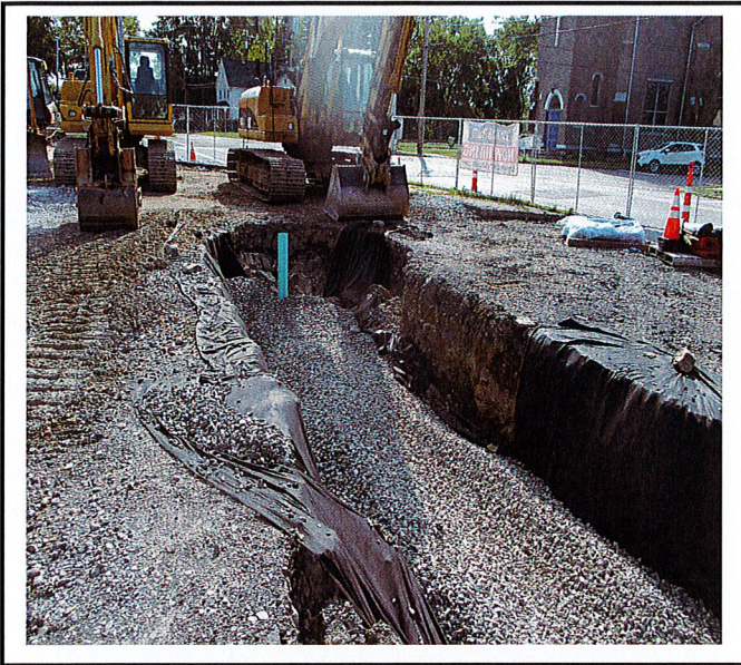
Infiltration Basin under construction.