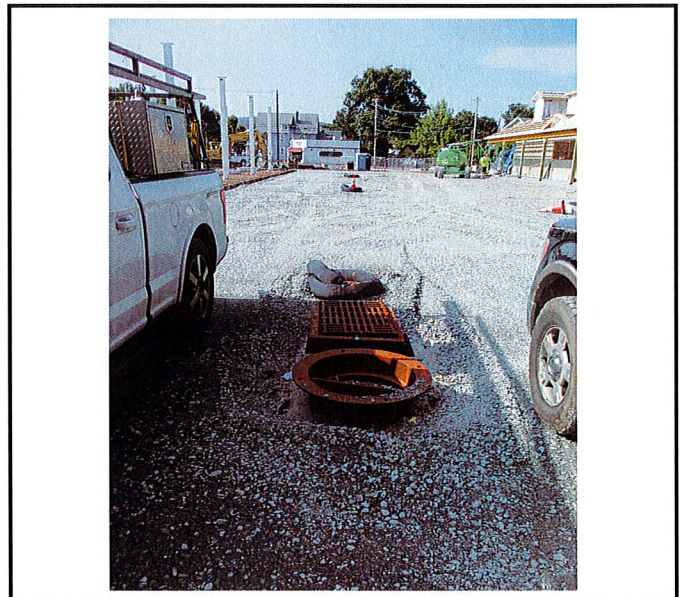
Stormwater pretreatment device- the lids are not placed on them and material can get down into them.