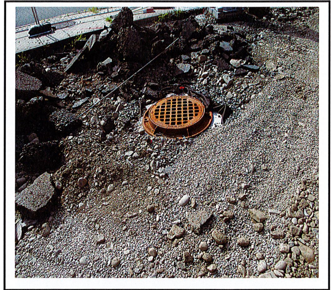
DW-5 no inlet protection installed.