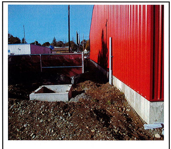
Area where storm drainage was supposed to go.