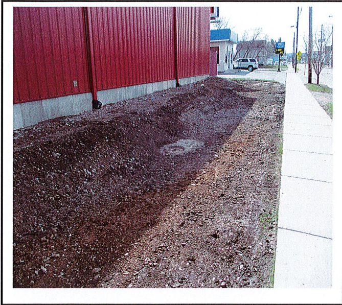
1 of 2 Dry wells installed along College Ave side of building.