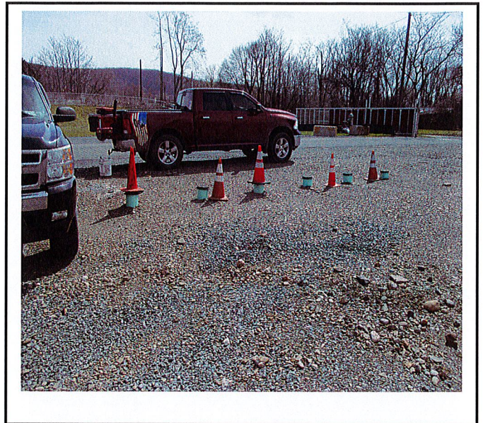
Observation ports to underground infiltration system.