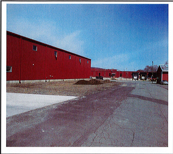
Topsoil for final stabilization.