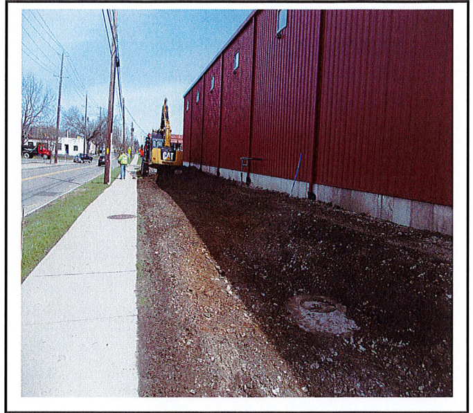
Shaping drainage swale to convey water to dry wells.