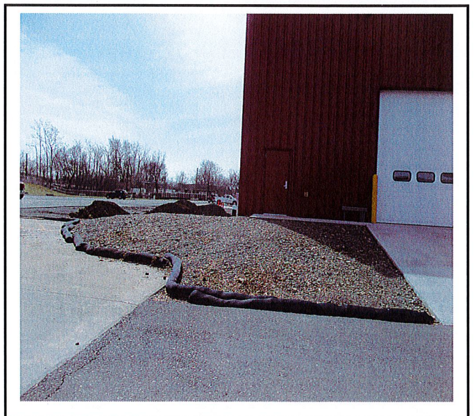
Silt sock installed around bare exposed soil.