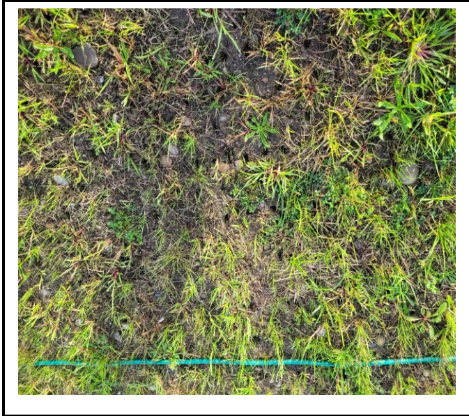
It appears contractor tried to aerate soil to promote vegetative growth. It did not work and decompaction is necessary.