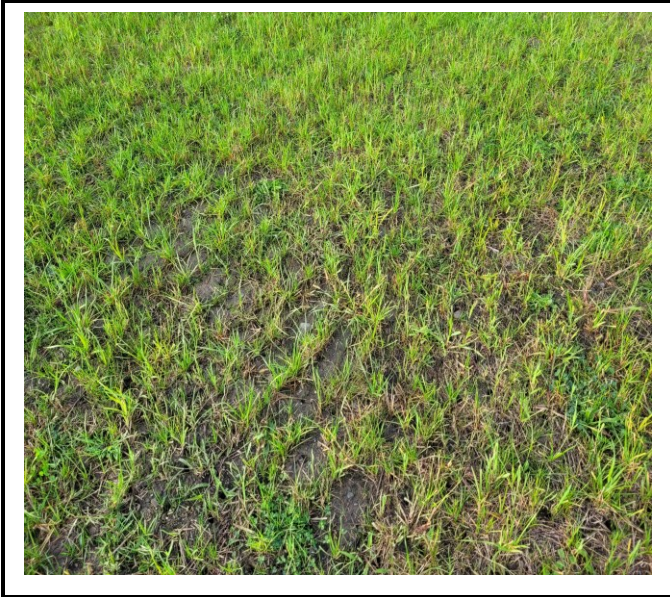
Not 80% vegetative cover and not decompacted.