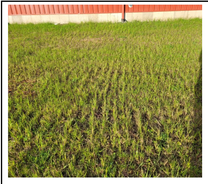
Not 80% vegetative cover and not decompacted.