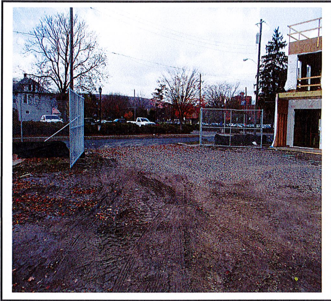
Construction entrance on West side of project is relocated but in good condition.