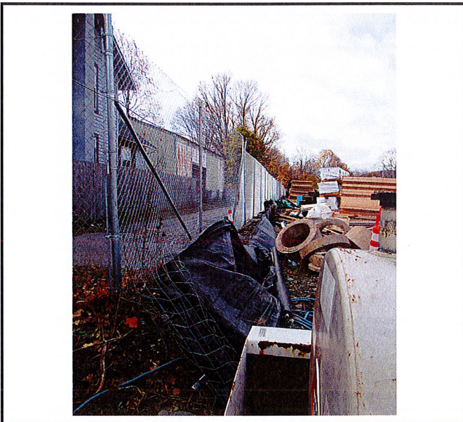
Silt fence encroached upon by building materials.