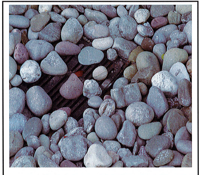
Drainage Grates between the building and the sidewalk need to have the fabric removed from under the grate.