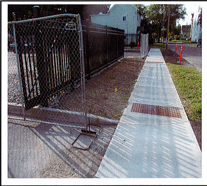
Area along Columbia Street requires stabilization.