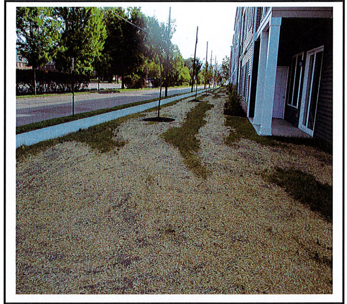
Area along Fifth Street that has been re-stabilized.