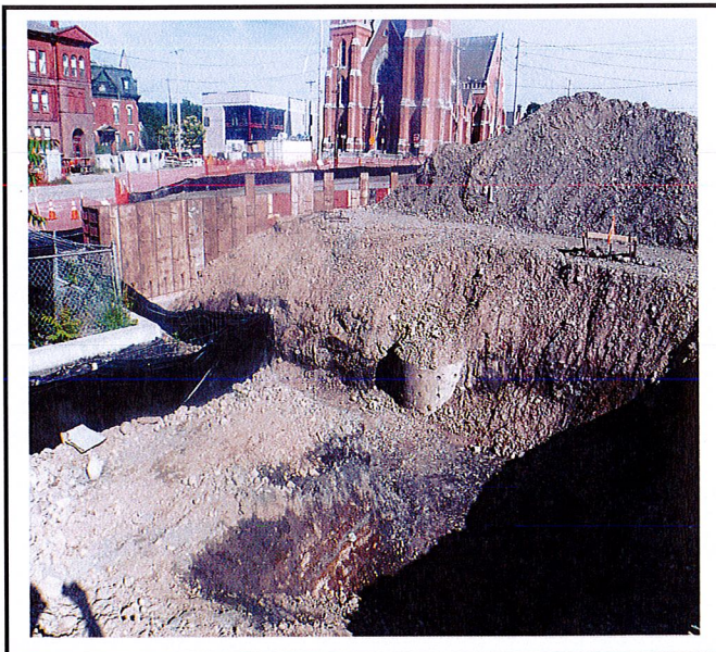
Decommissioned dry well.