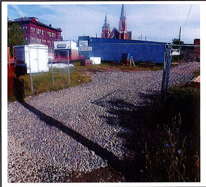
Construction entrance in good shape.