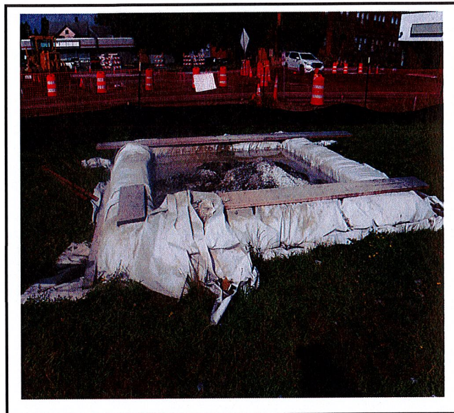
Concrete washout is at capacity and requires replacement.