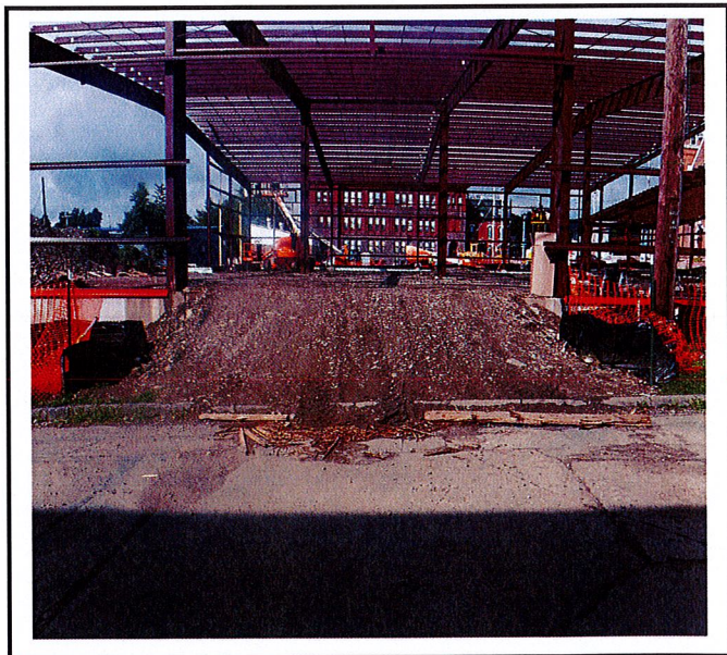
Monitor the amount of sediment tracked onto S. Magee Street.