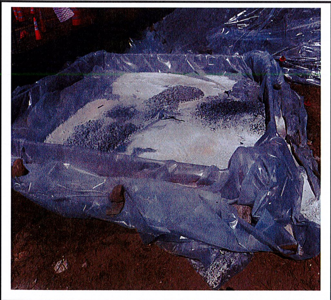
Concrete washout in working order.