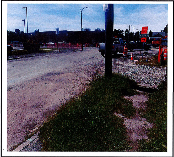
Sediment on W. third street needs to be swept up and disposed of properly.