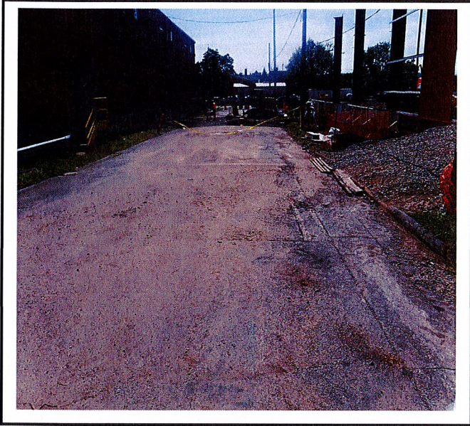
Sediment on Magee street needs to be swept up and disposed of properly