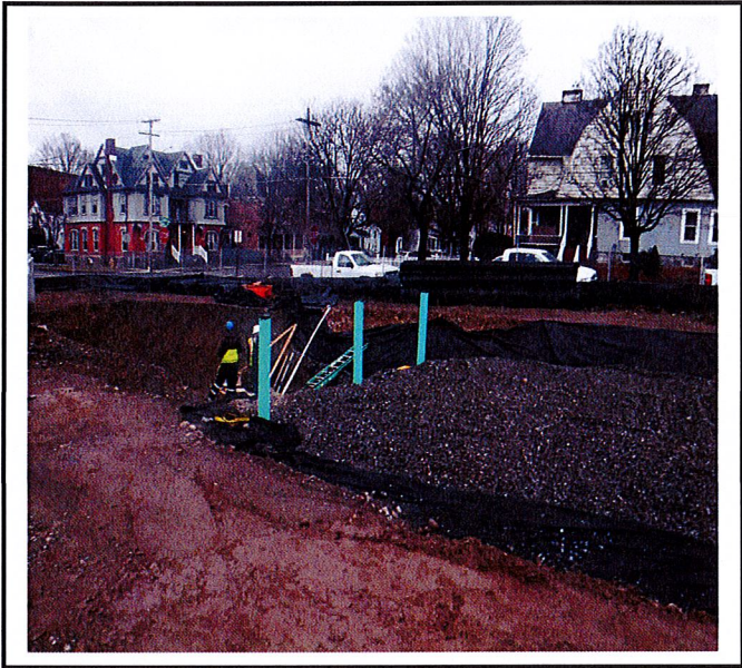
Remainder of stormwater chambers with observation ports have been installed.