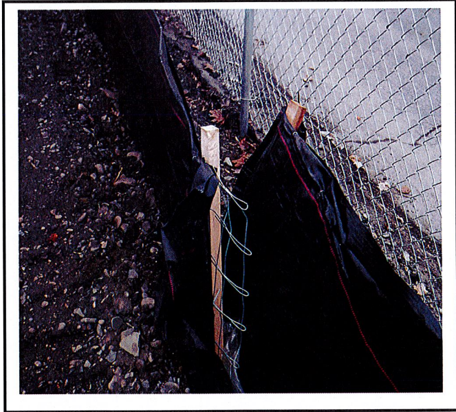
Silt fence splice needs repair (this was being repaired while I was still on site).