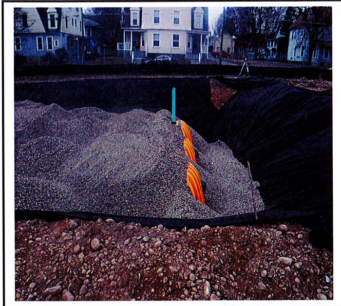
Underground stormwater chambers (north end). Observation port installed in isolation row.