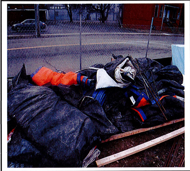
Concrete blankets piled on top of the silt fence.

PROJECT: LECOM City of Elmira Municipal Inspection March 21, 2019 BY: Jessica Verrigni, CPESC, CPSWQ