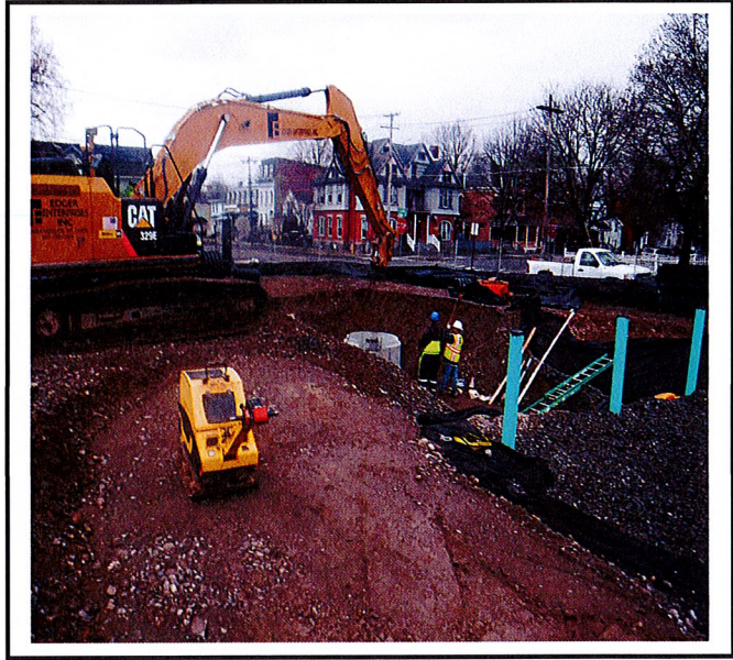
Installing infrastructure to underground system.