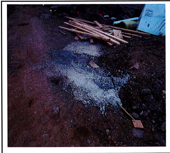
Concrete washed out onto the ground when there is a washout area provided on site.