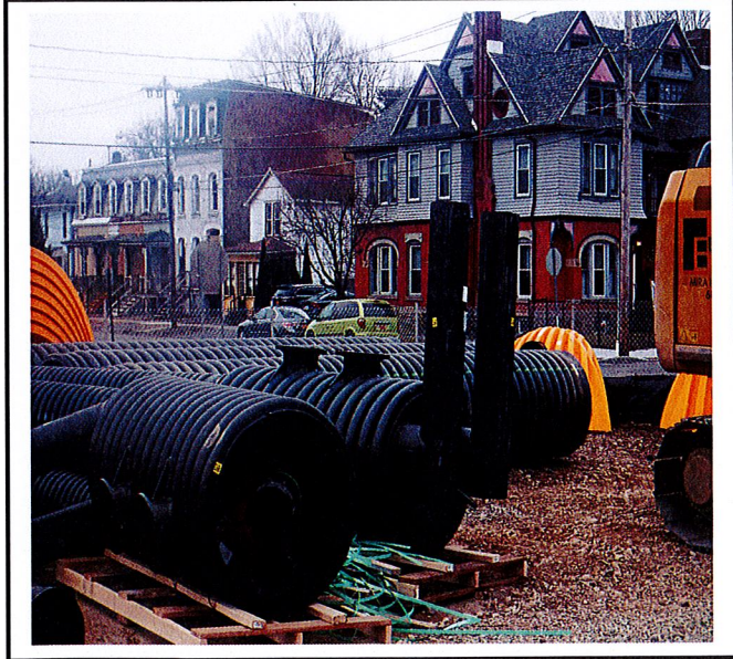
Stormwater water quality units.