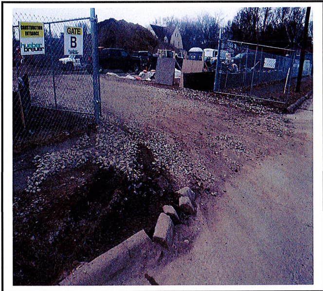
Construction entrance requires maintenance.