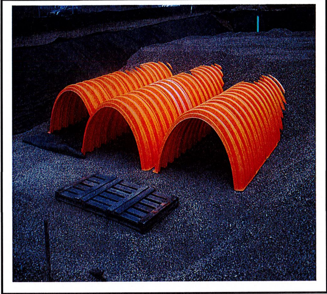
Underground stormwater chambers.