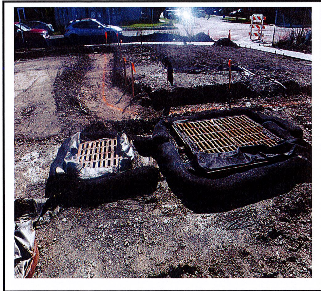
Inlet protection around underground infiltration drainage structures.