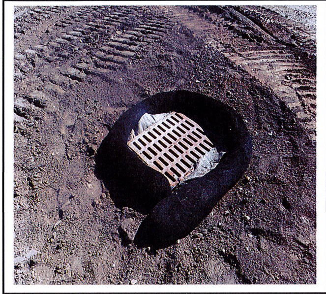
Inlet protection around catch basin.