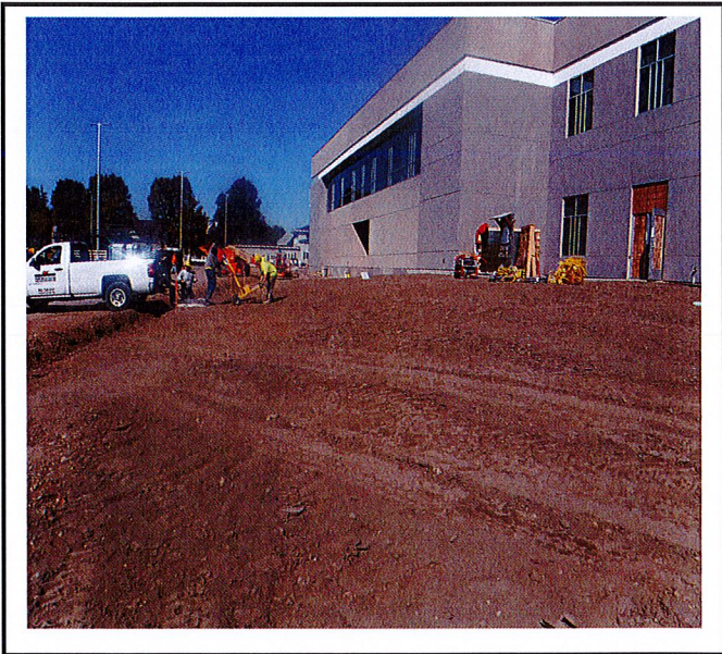
Site being prepped for stabilization.