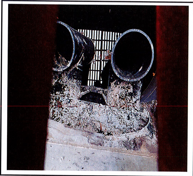
North-east water quality unit is not sitting straight up and down. It has also not been grouted correctly.