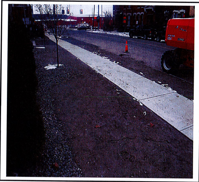
Erosion controls removed along Clinton Street. Sediment is being tracked into the road.