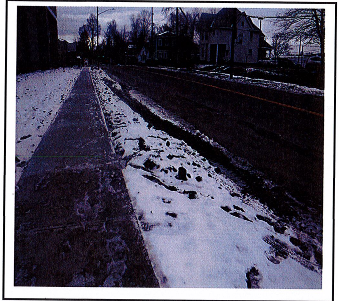
Erosion controls along Park Place have been removed. Equipment is tracking sediment into the road.