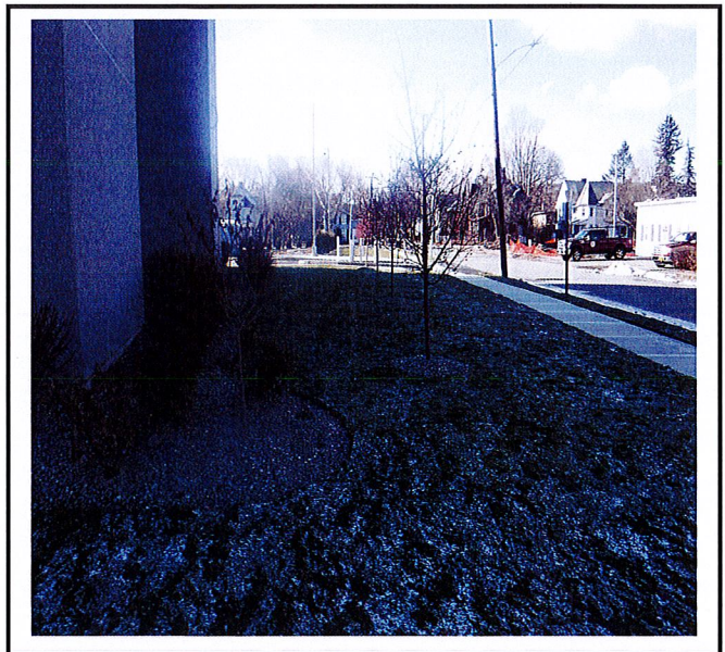
All open soil has been sodded.