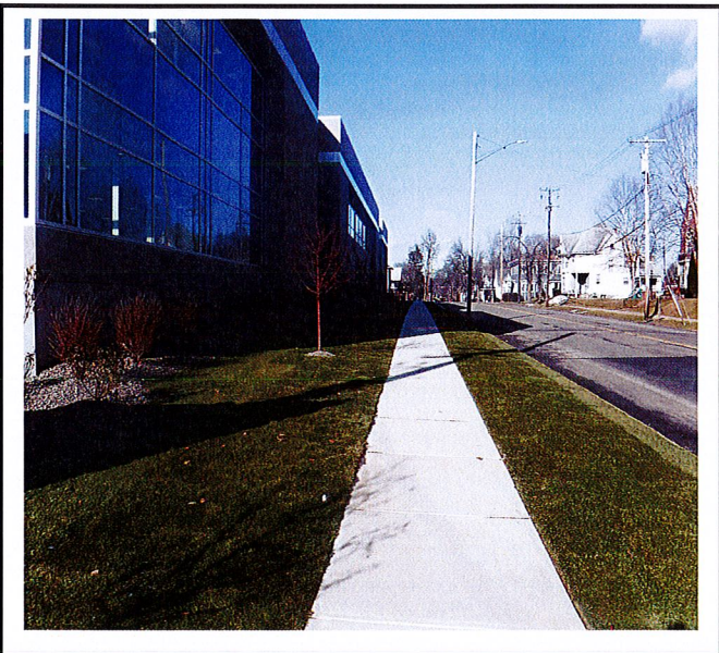
All open soil has been sodded.