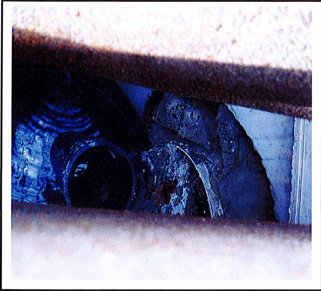
Parking lot WQ unit is still not grouted correctly.