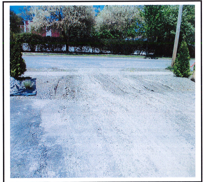
Area where the contractor is accessing the parking lot is creating a mud issue into the parking lot and off onto Fifth street.