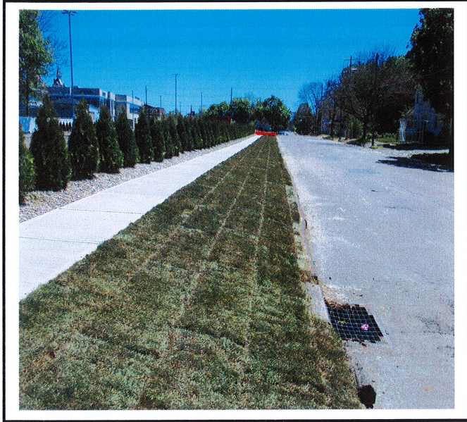
Areas between the sidewalk and street have had sod placed on them for stabilization.