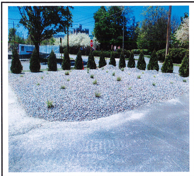
Landscaping being installed.