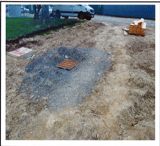
Stone "donut" around catch basin has been driven on and flattened out. Repair is required.