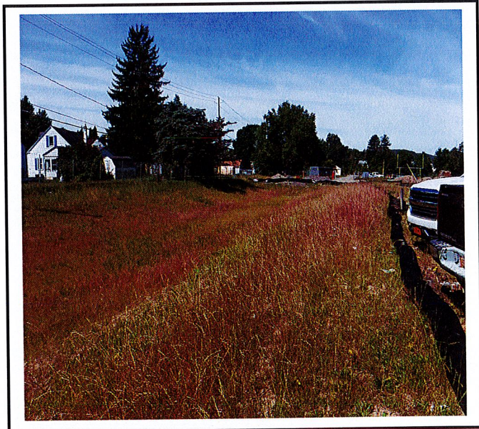
Infiltration basin has good grass cover.