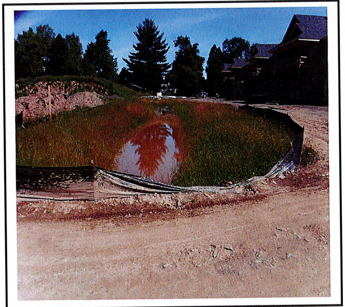
Silt fence at rear entrance point has been overwhelmed by sediment and water. Water has undermined the fence. Fence needs replacement.