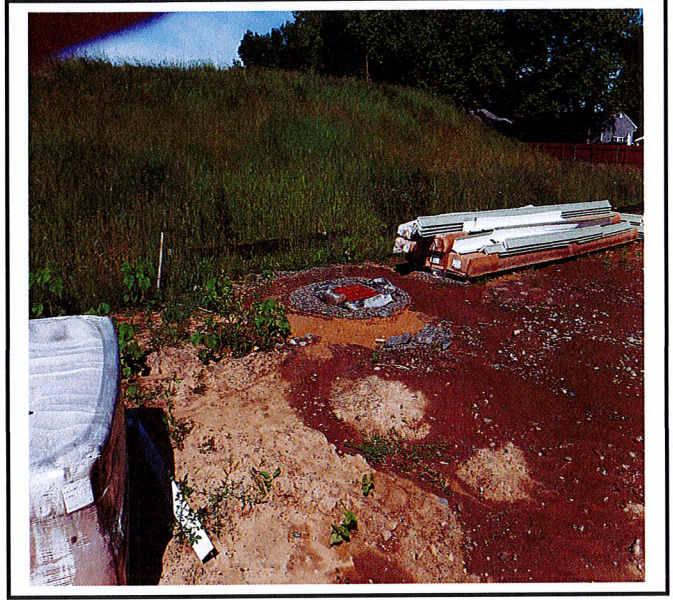
Compost sock at the rear of the building is over capacity and needs replacement or silt needs to be removed .