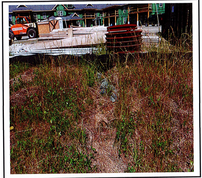
Water is getting under compost sock. Rock has been placed in eroded area but water is still cutting around it.