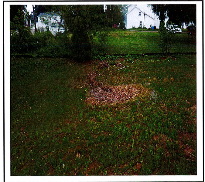
Erosion is occurring around catch basin. Grading needs correction.