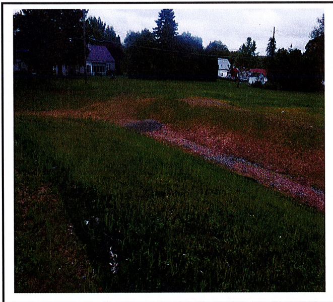
Check dams not installed correctly.