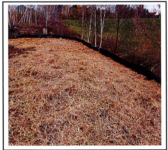
Contractor debris and trash has been picked up, temporary seed and mulch placed, and silt fence replaced or fixed around entire site.