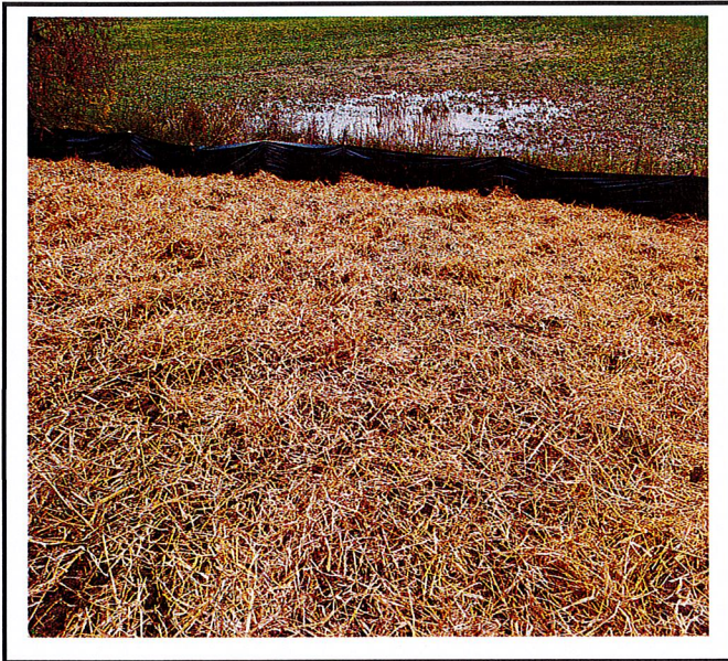
Contractor debris and trash has been picked up, temporary seed and mulch placed, and silt fence replaced or fixed around entire site.