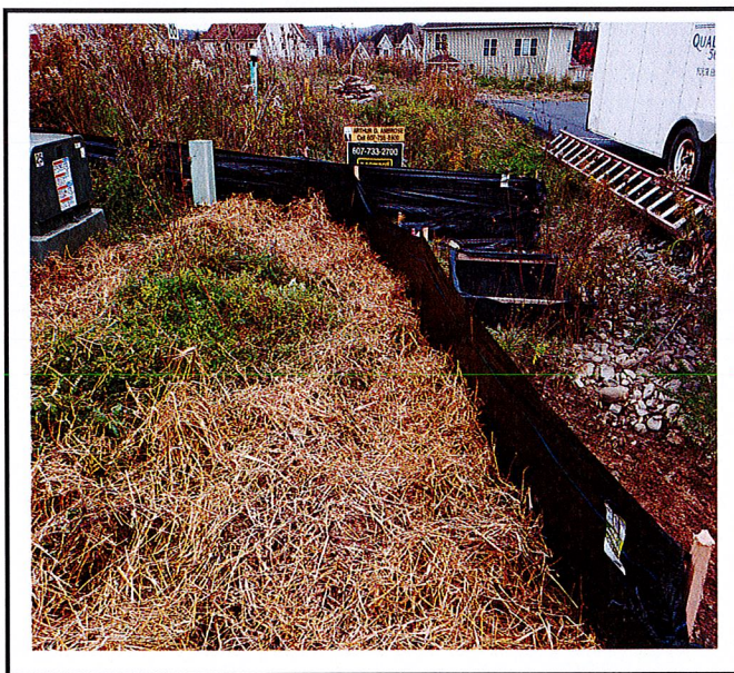
Contractor debris and trash has been picked up, temporary seed and mulch placed, and silt fence replaced or fixed around entire site.