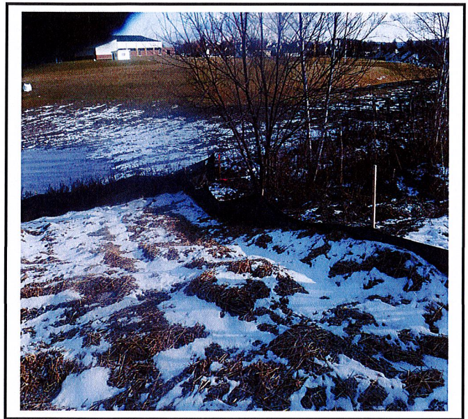
Silt fence requires maintenance.