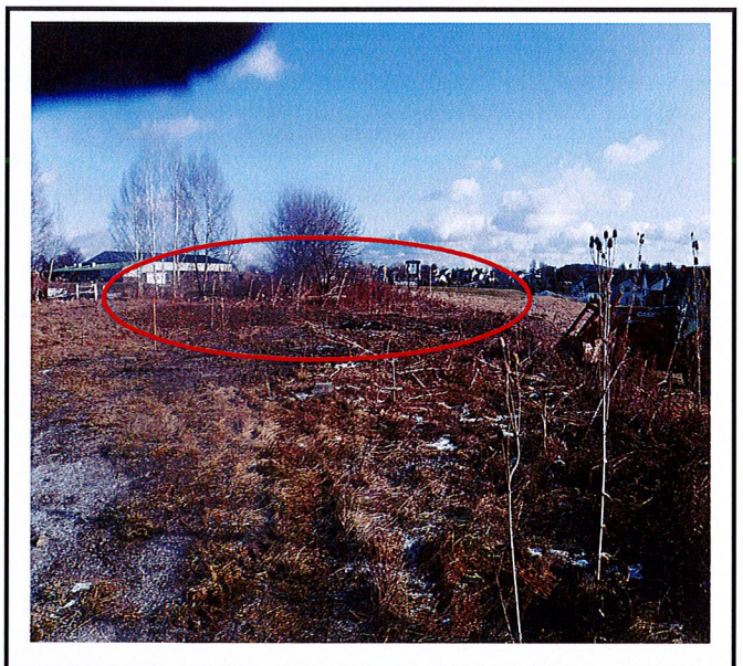
Lot 86- Area where house is going to be has been graded.