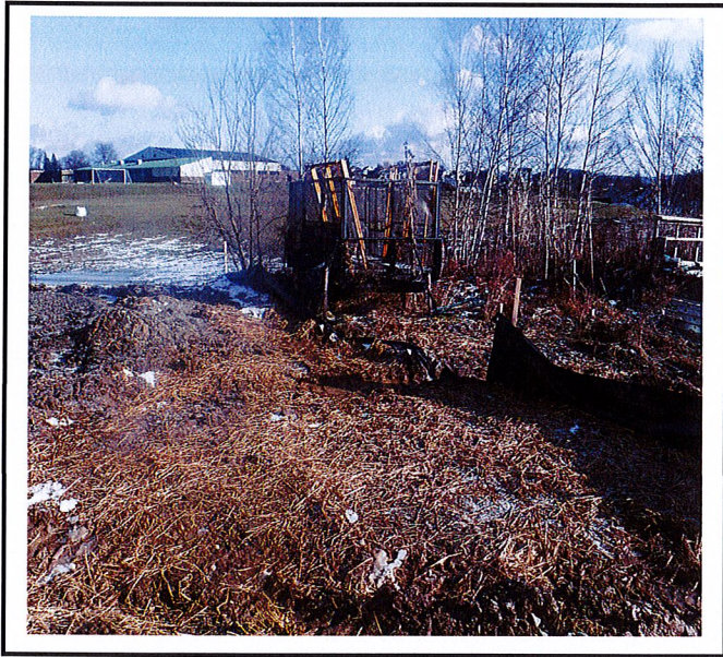
Silt fence has been taken down to allow traffic between lots.