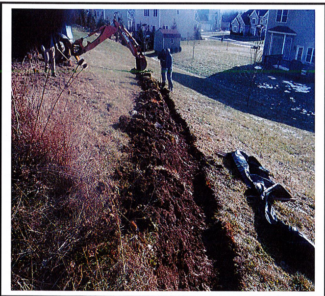
Silt fence being installed on Lot #86