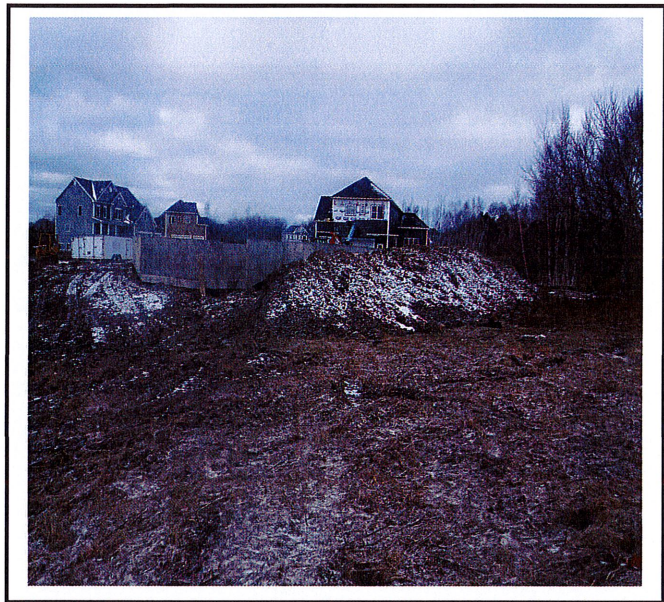
Soil stockpiles need to have stabilization applied.