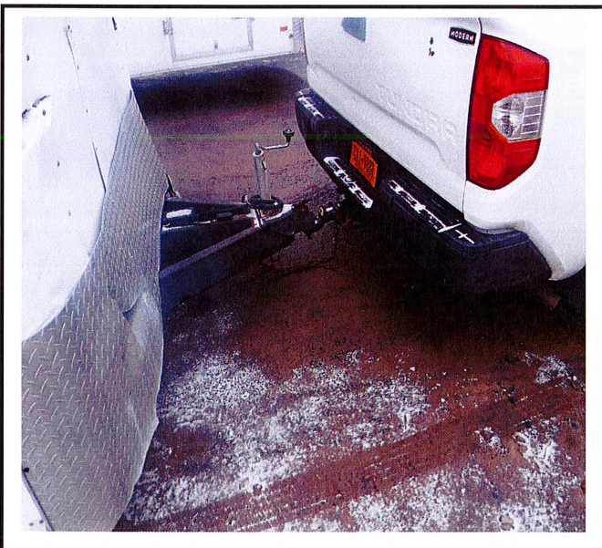
Construction entrance is installed but traffic for foundation is causing mud to track onto road.