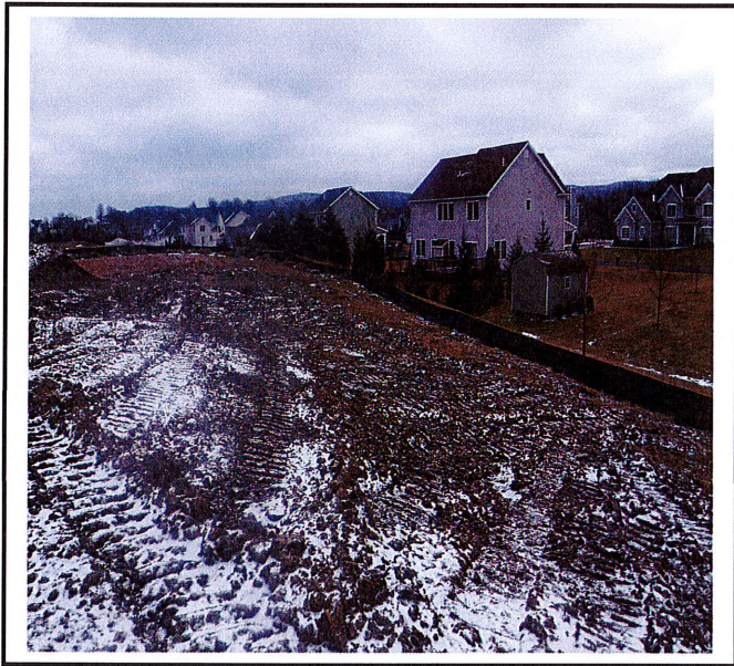
Areas of open soil sitting idle need to have soil stabilization applied.