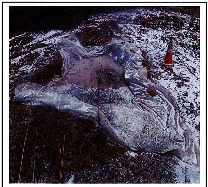
Concrete washout needs to be replaced. Liner needs to be staked to the ground better. New washout required before next pour.