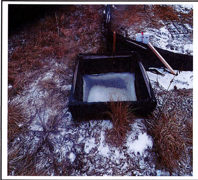
Some dry well are filled with water and frozen over.