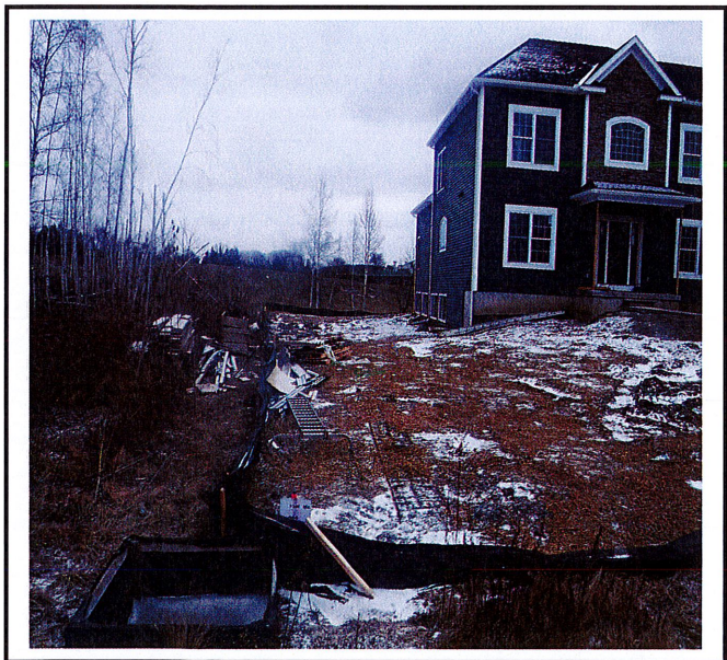
Silt fence needs to be maintained around the site where it is knocked down.