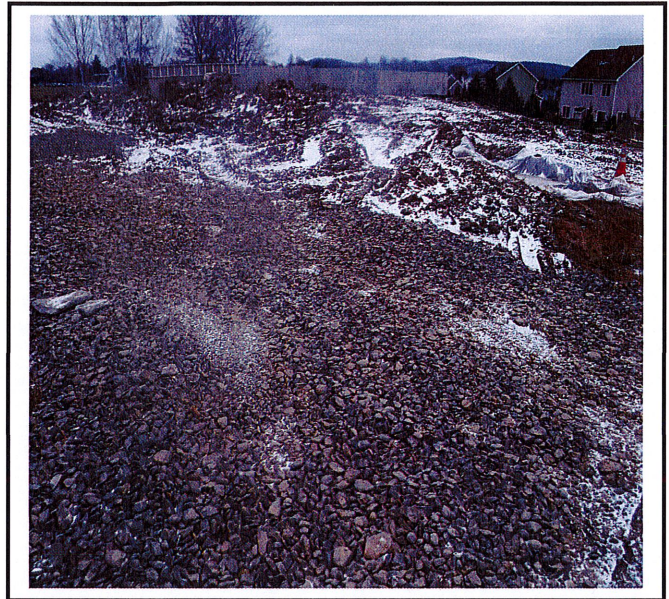
Construction entrance is installed but traffic for foundation is causing mud to track onto road.