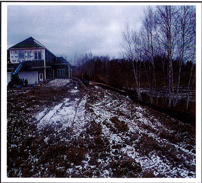
Areas of open soil sitting idle need to have soil stabilization applied.