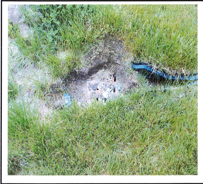
Dry well at the front of the property in the ditch is not on Lot #65 but still requires protection.