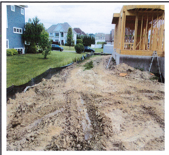
Silt fence requires repair.