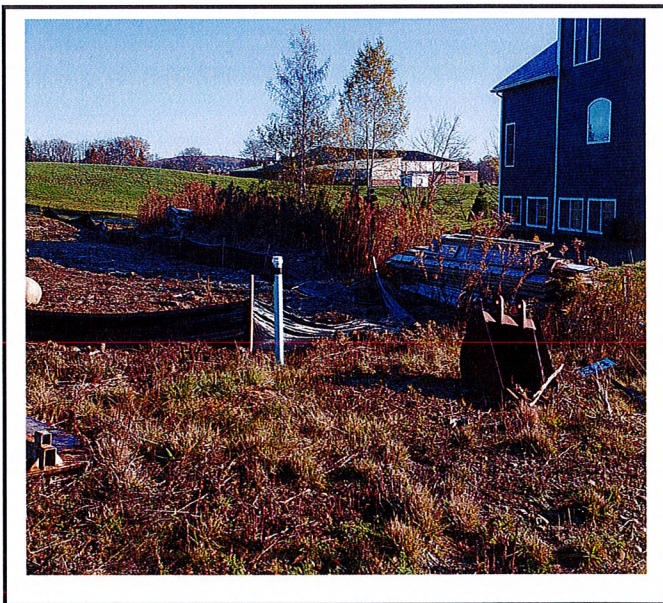
Silt fence on lot 84 needs maintenance.