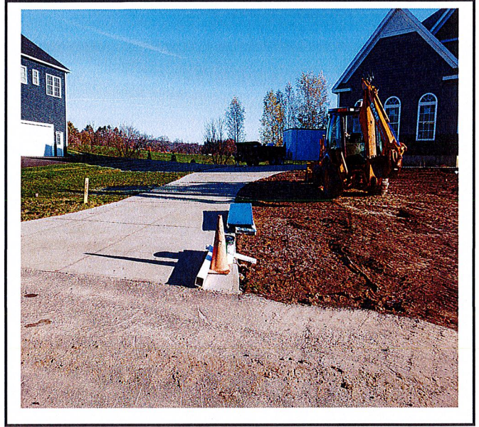
Driveway has concrete and needs no construction entrance. Lot 86