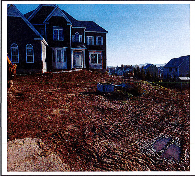
Lot 86 needs stabilization out front.