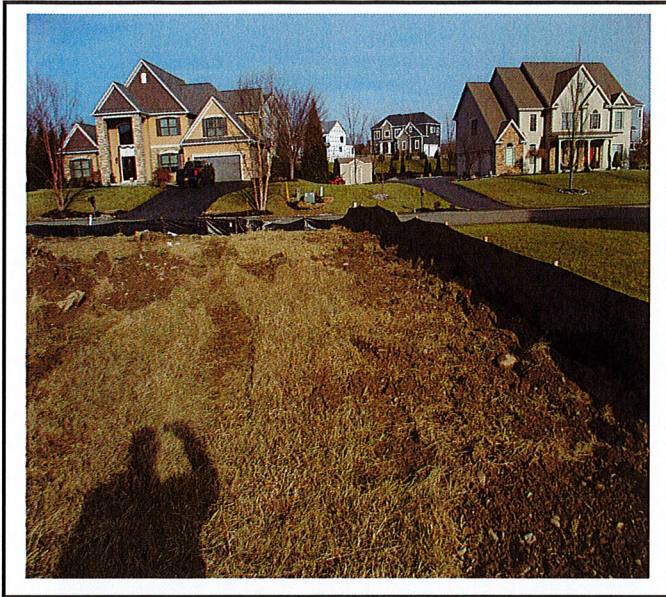
Silt fence installed and functioning.