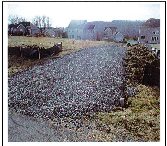
Construction entrance installed but need driveway permit from the Town.