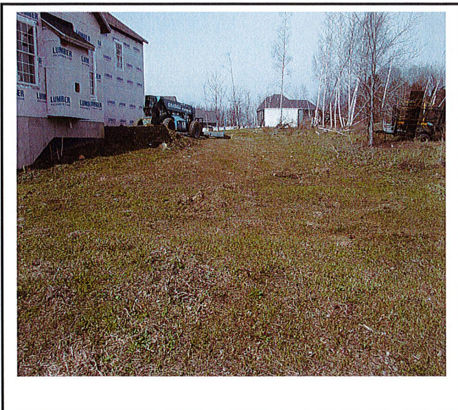
Inactive areas have been stabilized.