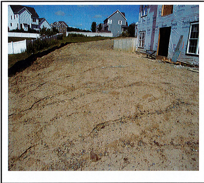
Erosion occurring at rear of property.