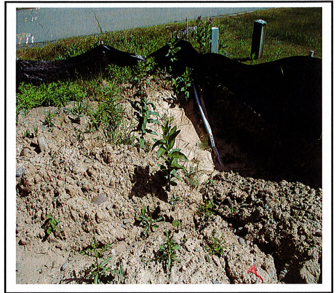
Silt fence not toed in where electric line needs to be buried.