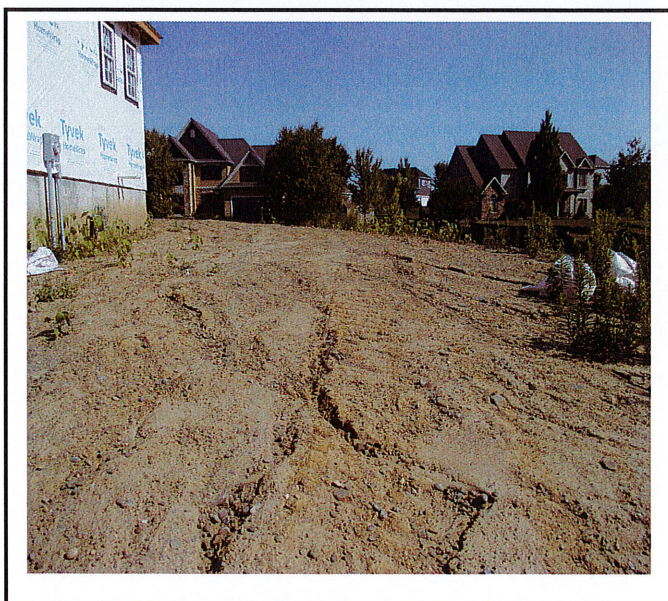
Open soil needs to be stabilized to prevent erosion.