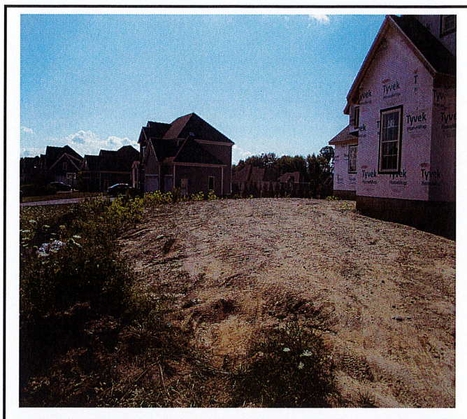
Open soil needs to be stabilized to prevent erosion.