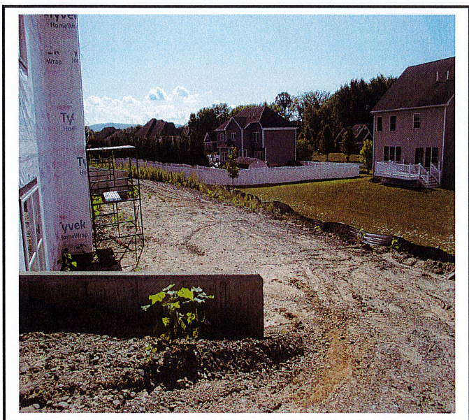
Open soil needs to be stabilized to prevent erosion.