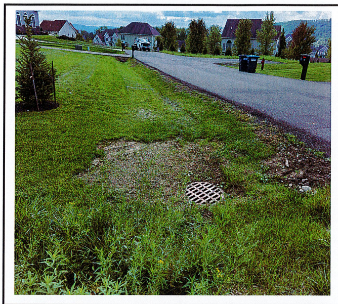
Bare soil around dry well needs to be stabilized.