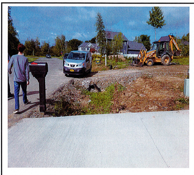
Driveway pipe installed on Lot 83 without highway department permit.