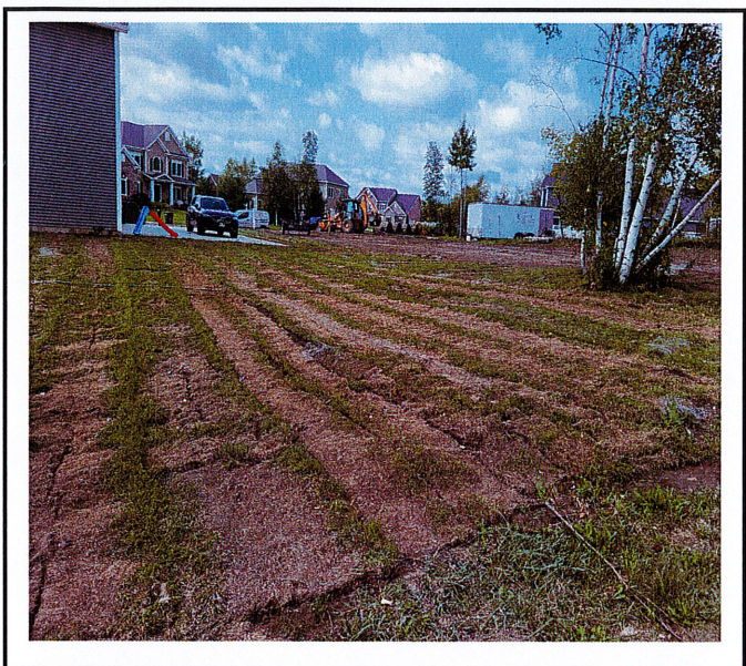
Sod is being placed to stabilize the lot.