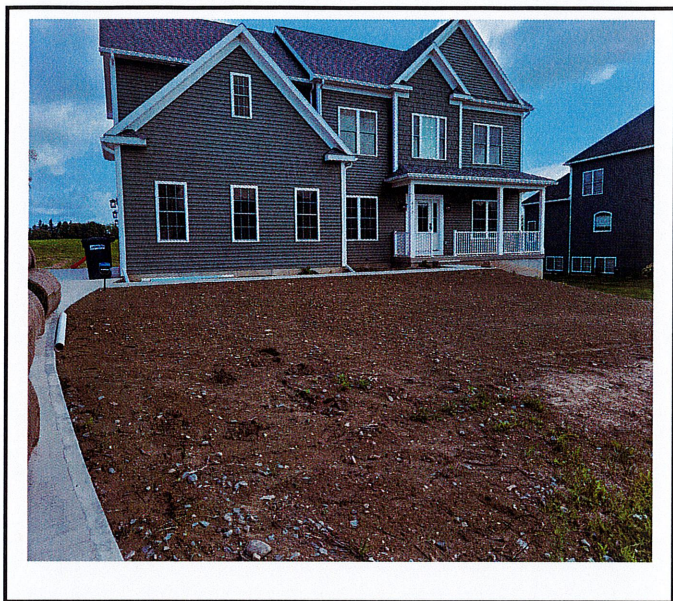
Final grading and topsoiling has been completed.