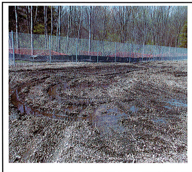
Severe compaction and standing water issue.