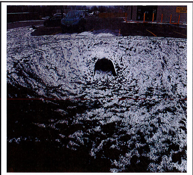
Inlet into the infiltration basin.