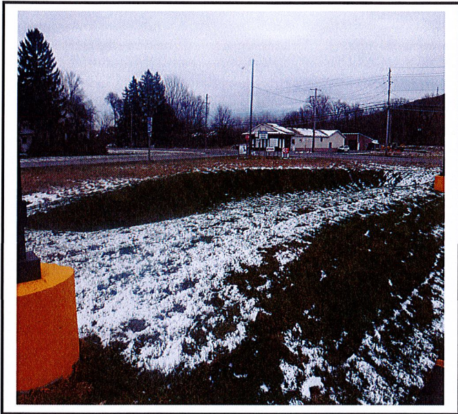
Infiltration basin has been completed and sod placed for stabilization.