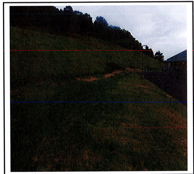
Drainage Swale behind building.