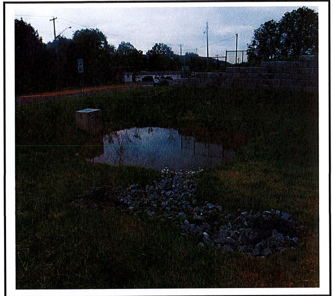
Stormwater basin 1