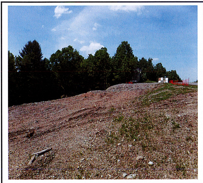
Large area of soil on a steep grade is opened up and not stabilized. No equipment is on site so it is sitting idle.