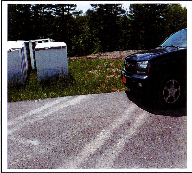
Construction entrance has not been installed on the project and trucks are entering through municipal drainage ditch.