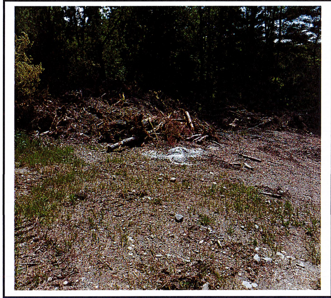
Concrete washed onto the ground. Concrete washout not installed.