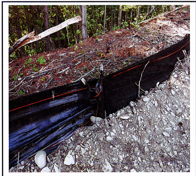
Silt fence requires repair in a number of areas. The silt fence is not installed along the entire length of open disturbed soil.